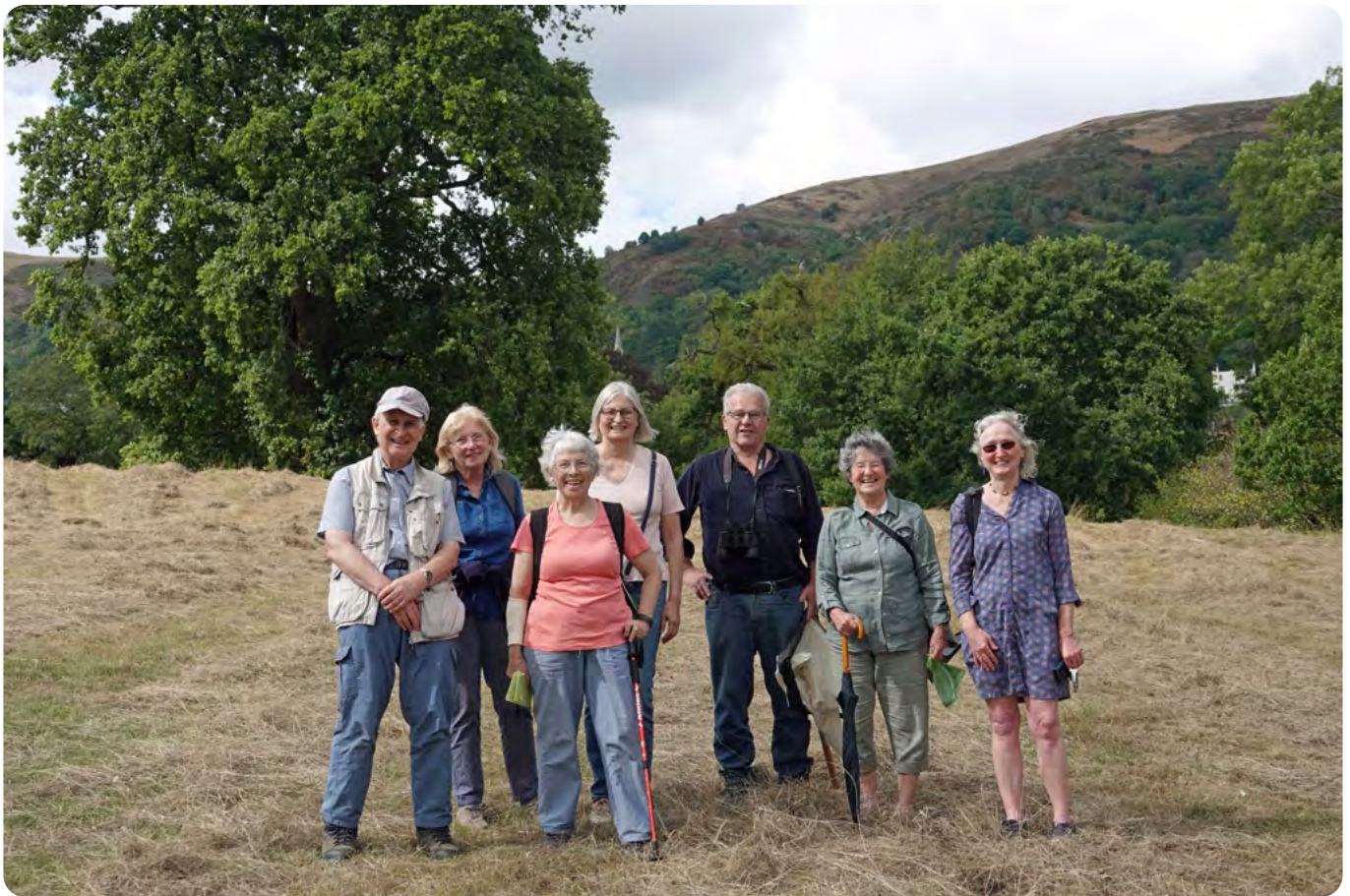
Woodfords meadow survey volunteers, © Peter Edwards.