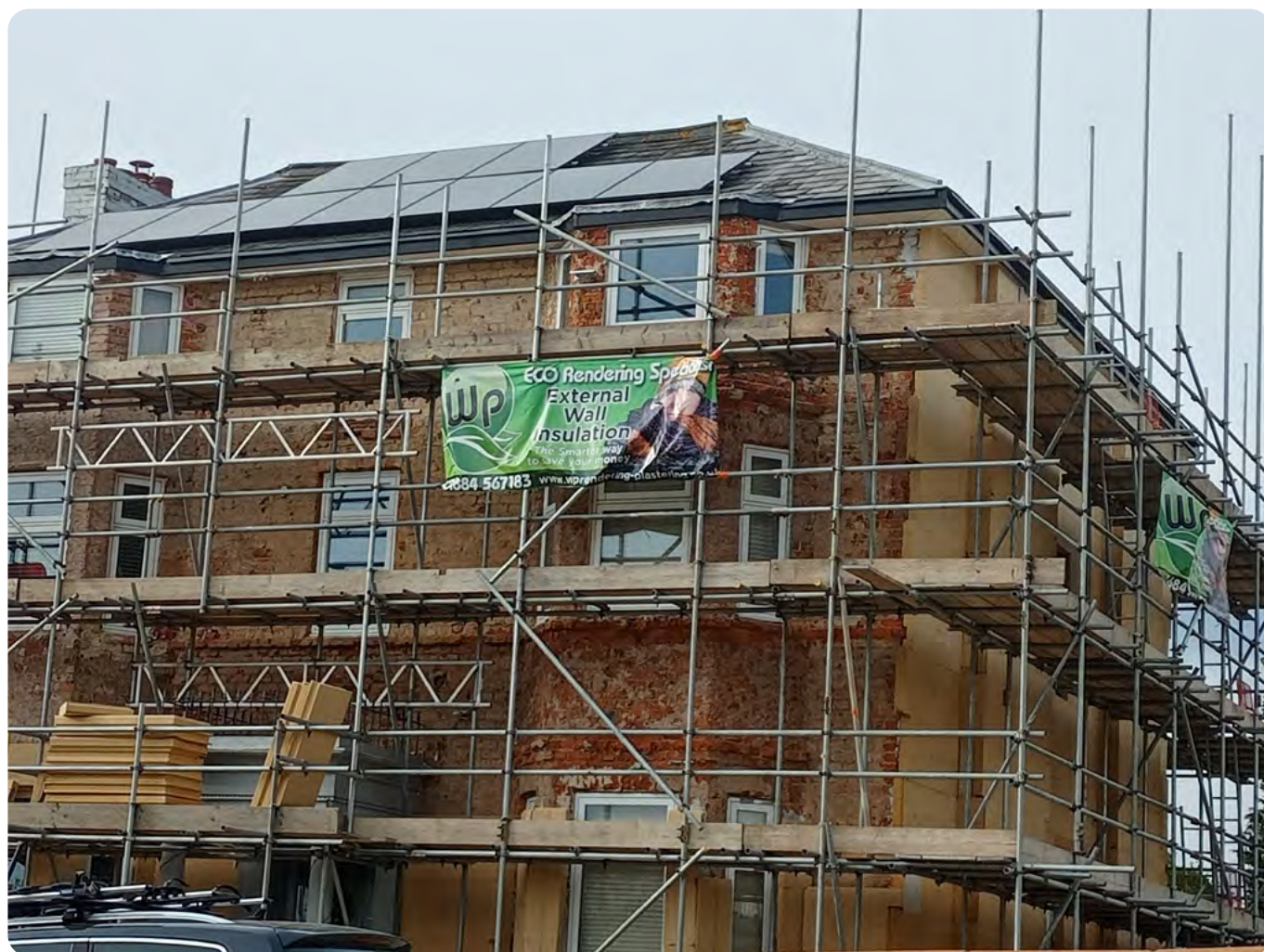
Fitting external insulation and solar panels, West Malvern.

Target 8. Increase tree canopy and woodland cover (combined) by 3% of total land area in Protected Landscapes by 2050 (from 2022 baseline).