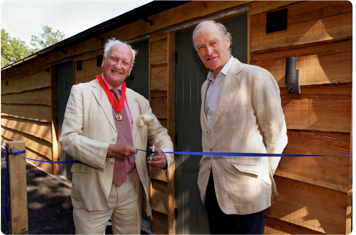
The opening of the new loos, grant funded by Farming in Protected Landscapes scheme, Eastnor Park.