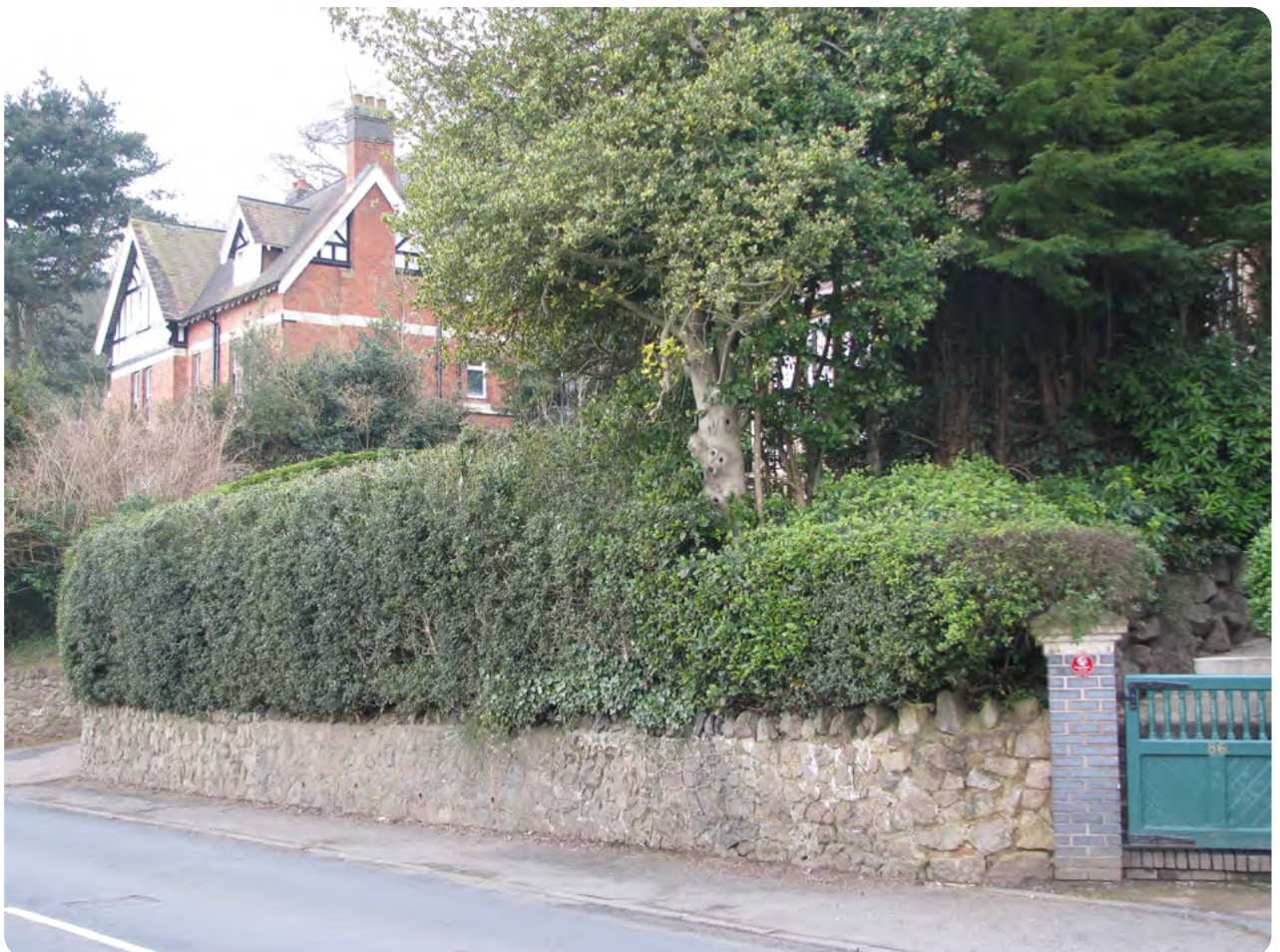
Locally characteristic property boundary, Malvern Wells.