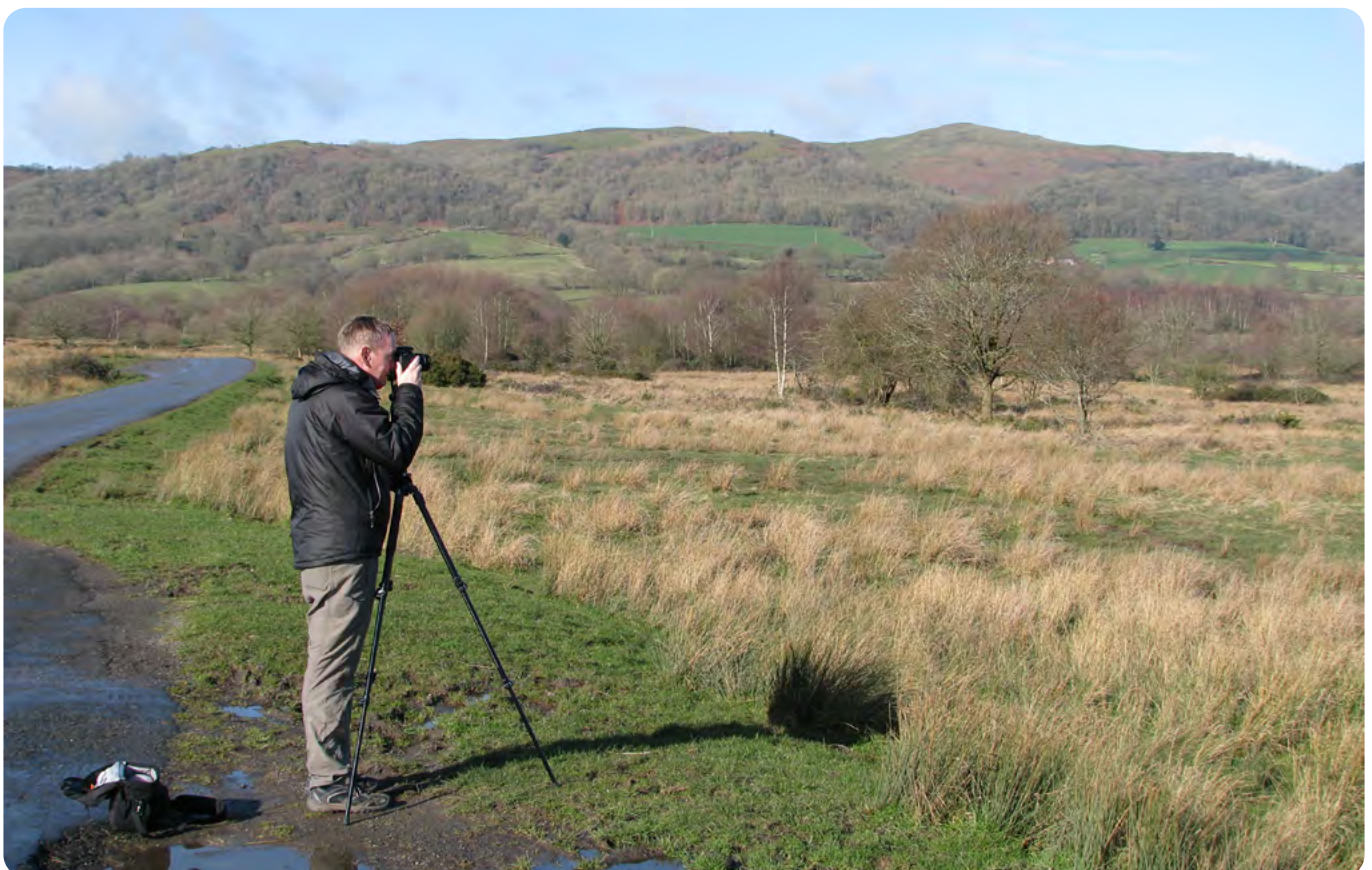
Monitoring landscape change, Castlemorton Common.