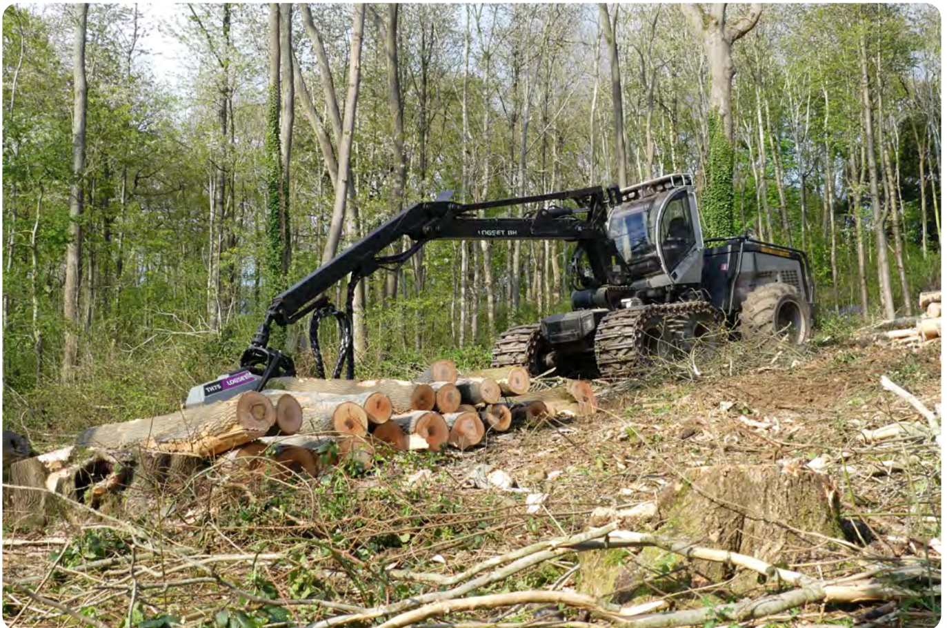
Timber harvester, Cradley.