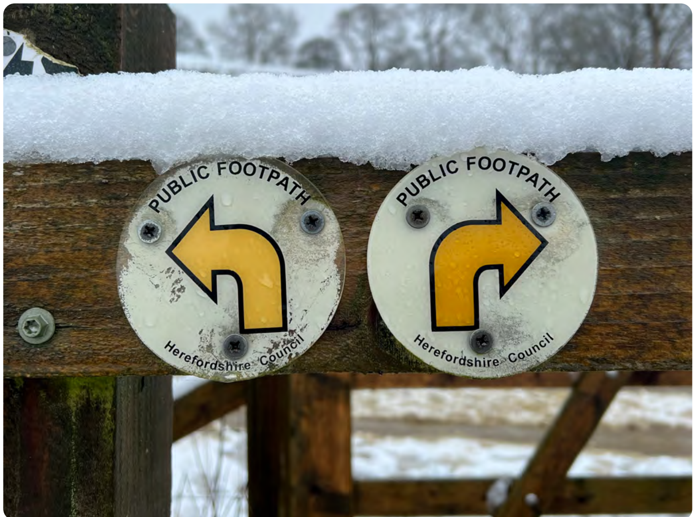
Clear footpath directions.