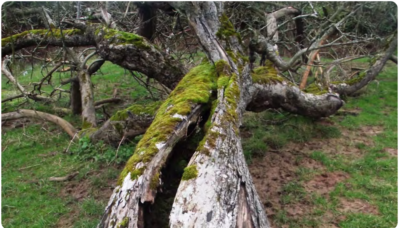
A fallen orchard tree, Mathon.