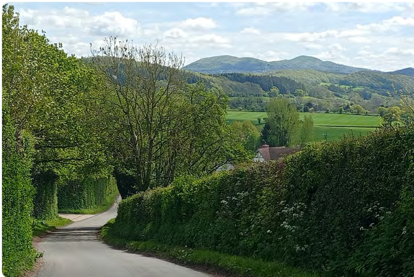
Quiet country lane, Suckley.

6.72 'Miles Without Stiles' are promoted footpaths and tracks which are suitable for use by those who do not want to clamber over barriers when out enjoying the countryside. The National Landscape Partnership provides links to ideas and resources through the website 36 . Herefordshire Council created these routes, in conjunction with Natural England and the Malvern Hills National Landscape Partnership.