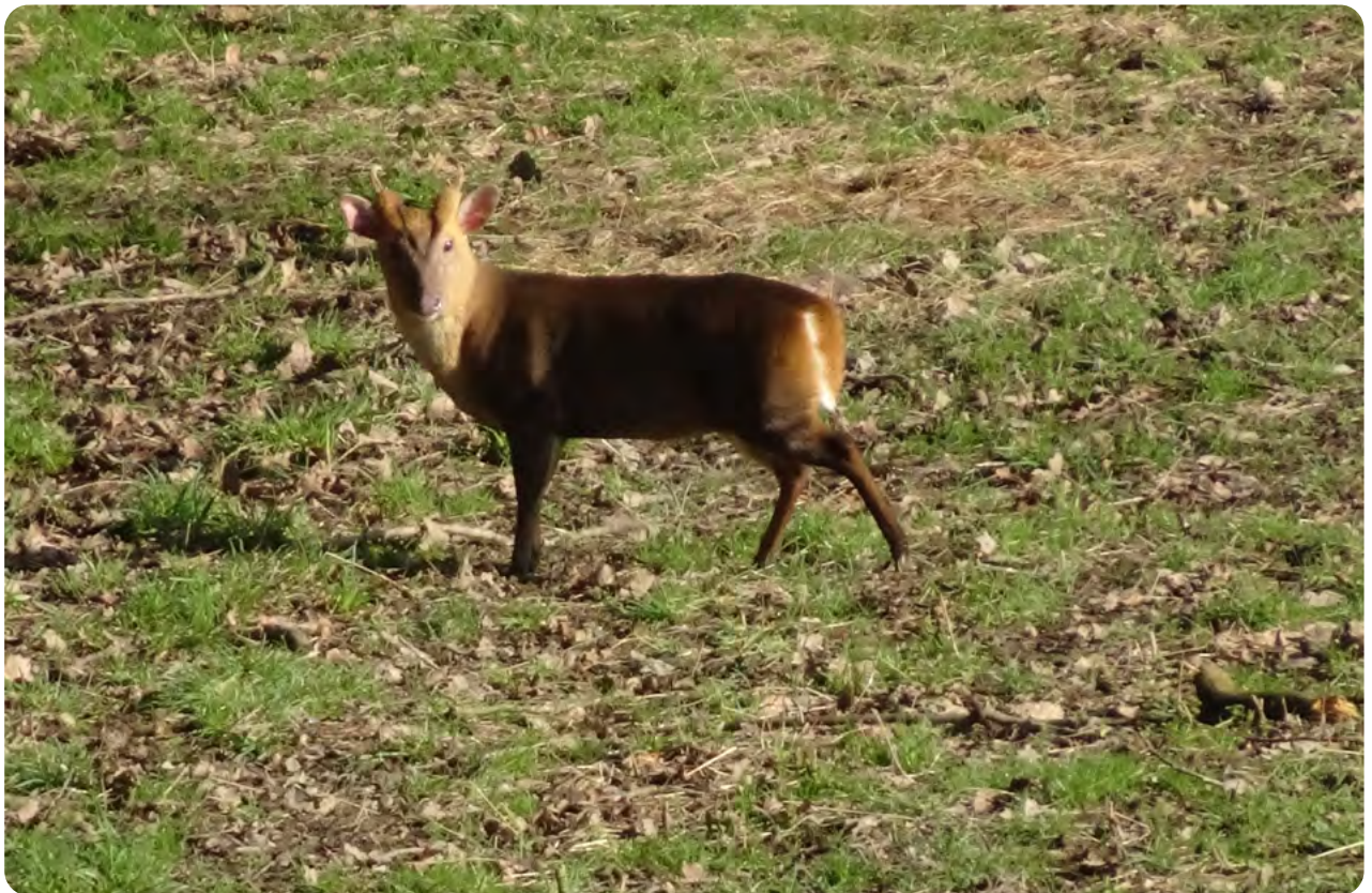
Muntjac deer, Mathon.