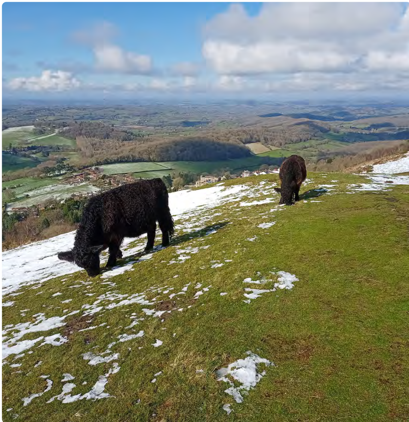
Views west from the Malvern Hills.