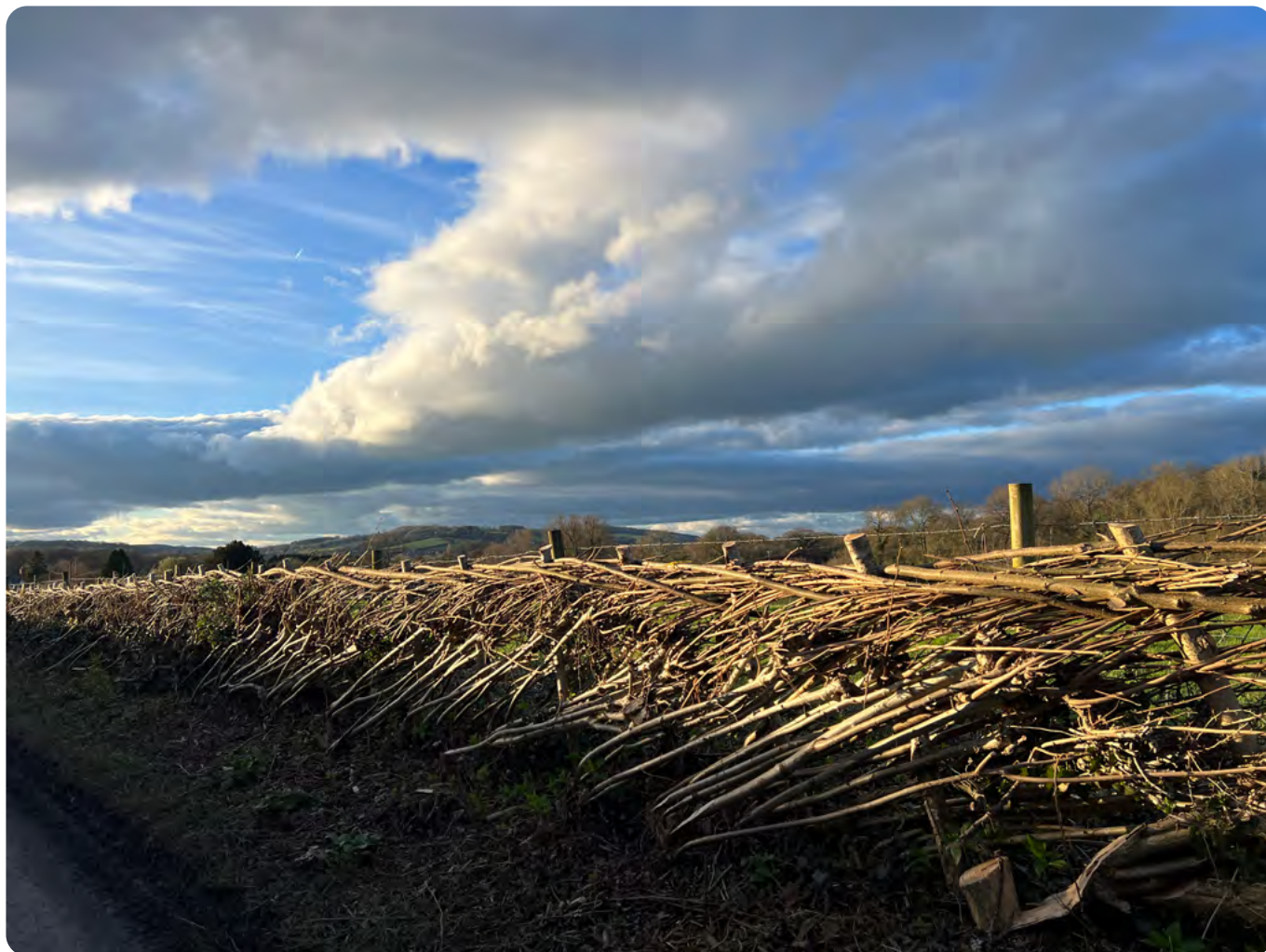
Laid hedge, Mathon.