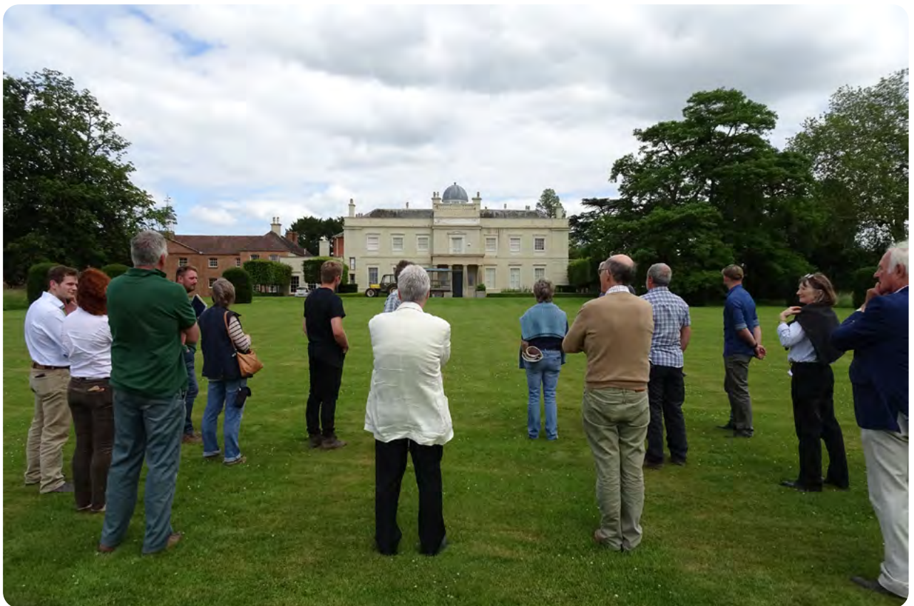
Land manager's event, Bromesberrow Place.

3.13 The National Landscape is an inspiring place where culture, heritage, and the natural environment is celebrated. Natural beauty is conserved so that the landscape is valued and loved by all. The connection to natural beauty provides healing, health and happiness. Everyday connections to a nature-rich world are commonplace and valued. The cultural and historic environment is in good condition, valued, celebrated and better understood by residents and visitors alike. The towns and villages are vibrant and viable centres for the future. Everyone feels a connection to their place and this provides benefit to people's health and wellbeing. There is a high-quality, sustainably designed, built environment that provides residents and visitors with a safe place to meet, live, work, play and connect.