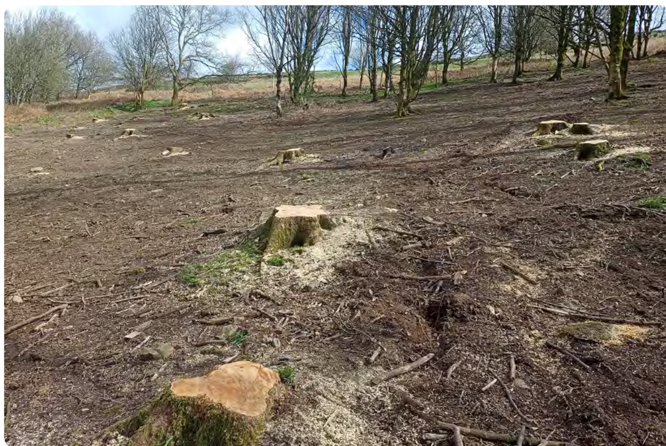
Tree clearance to restore acid grassland, Malvern Hills.