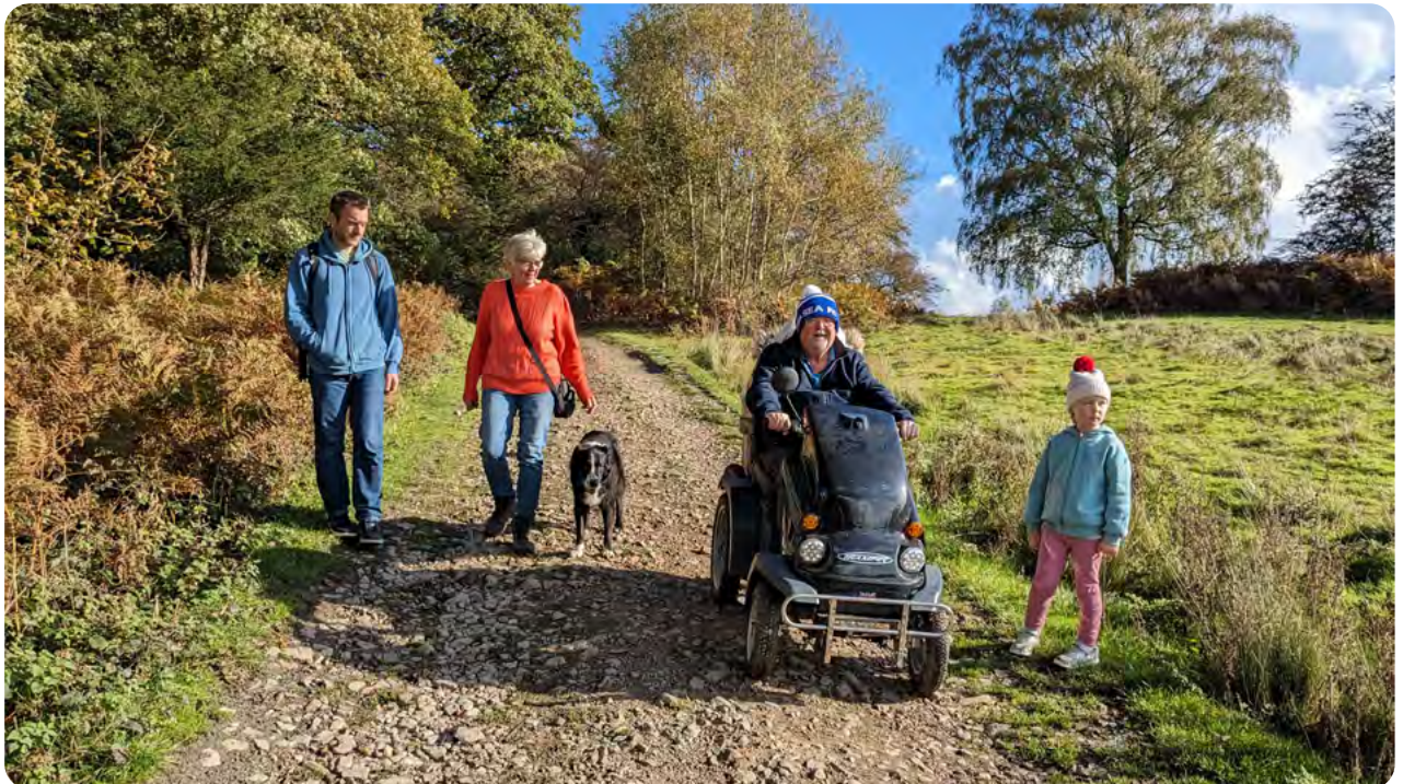
Easy access track, Eastnor Park.

2.13 The impact of these issues on the natural beauty of the Malvern Hills National Landscape were considered during the development of the vision and the outcomes.