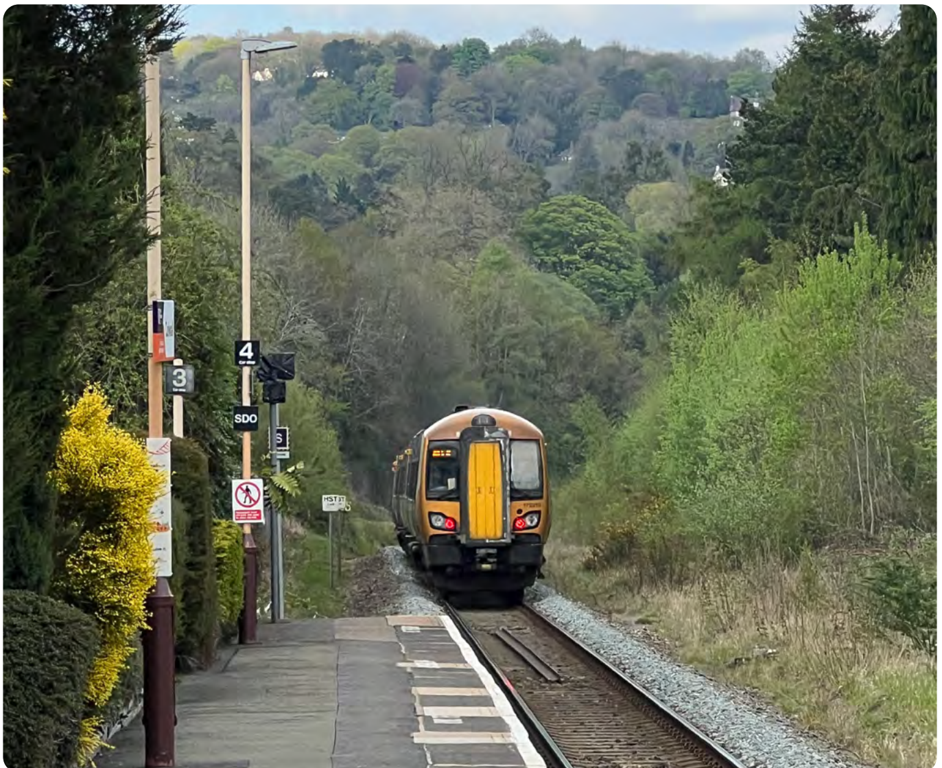
Train arriving, Colwall Station.