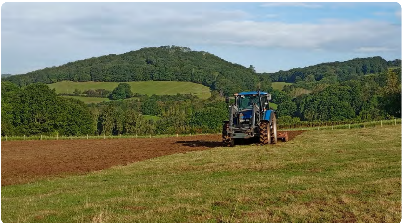
Meadow restoration, Mathon.