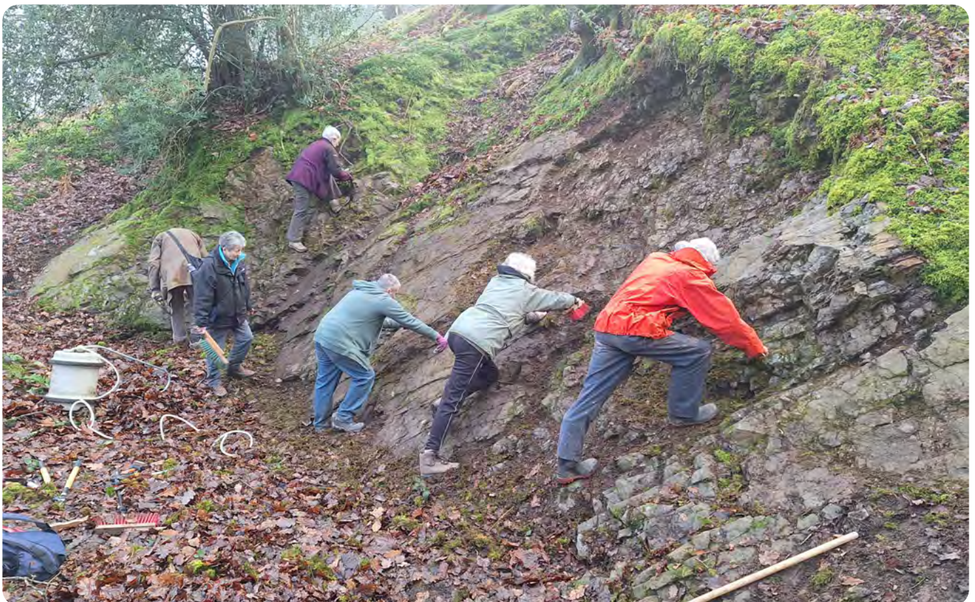
Geovolunteers conserving a geology site.

NA2.2 Understanding of the geological value of the National Landscape should be promoted, including its links with the historic environment and the need for its protection and management. This should be supported by continuing exploration and research into the geology and geomorphology of the area. Relevant authorities should develop policies and adopt decision making for development that seek to protect geological and geomorphological resources and features.