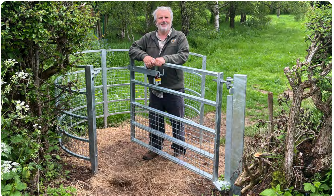
Newly installed access gate, Colwall Village Garden.