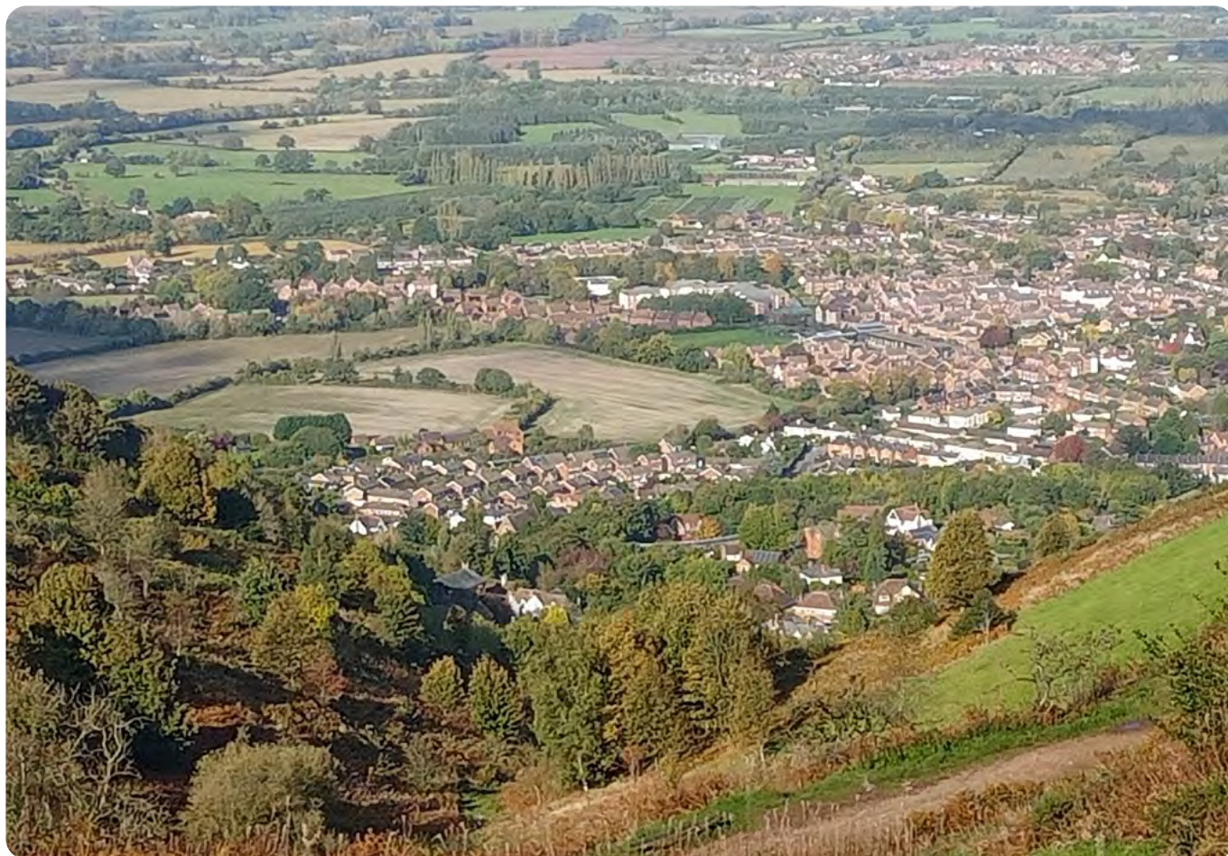
Development in the setting of the Hills, Malvern.