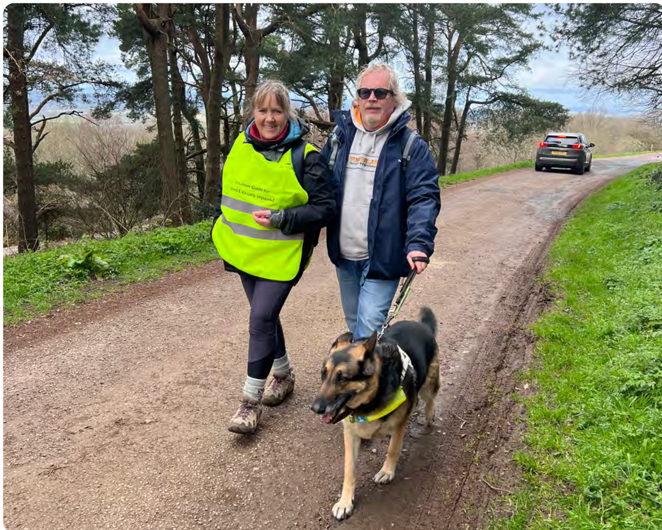
Guided walk for the visually impaired, Malvern Hills.