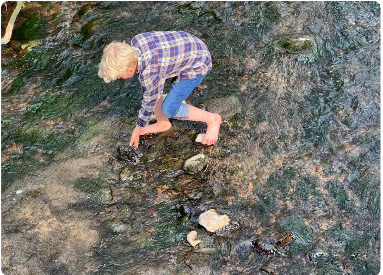
Clean, clear brooks, Mathon.