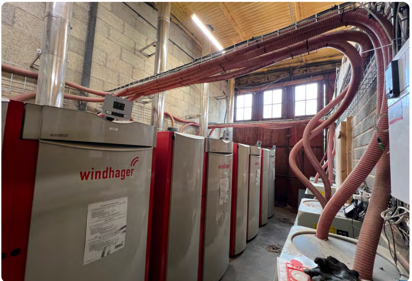
A local biomass boiler using locally sourced fuel, Cowlall.