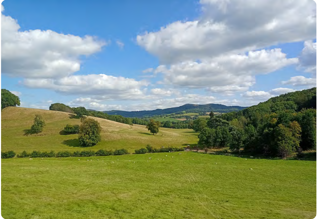
Hope End Park, Colwall.