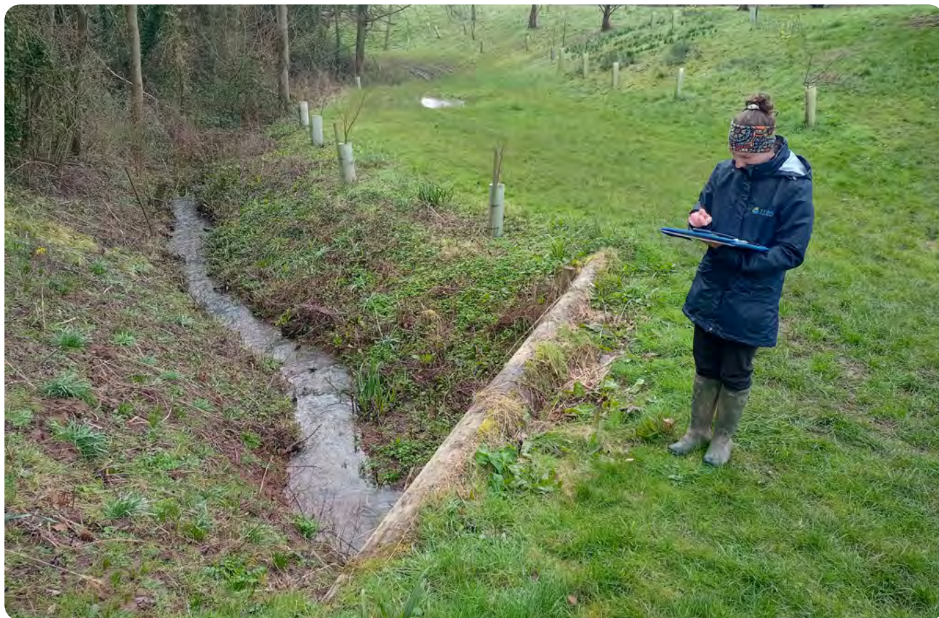
Water quality monitoring, Lulsley.