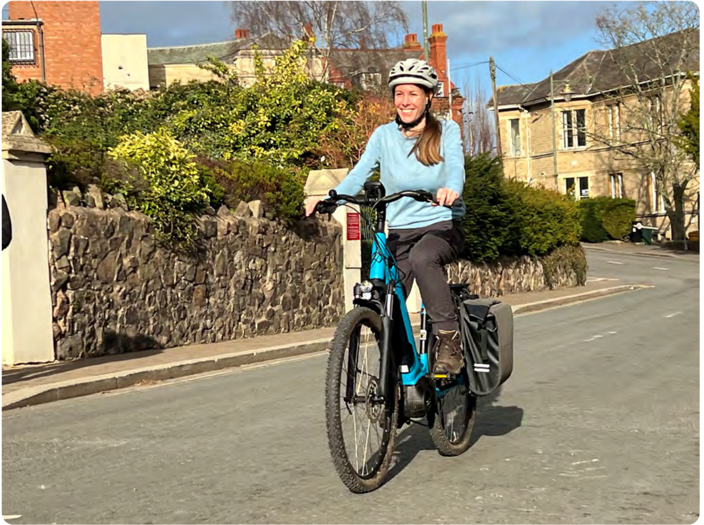
Electric bike hire from Malvern Car Club.

PE4.3 Work in partnership to develop the Malvern Hills as an area for show-casing new tourism technologies including: