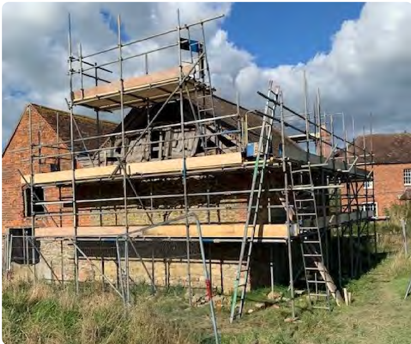
The Granary build being restored under an Historic Buidling Restoration Grant, Eastnor.