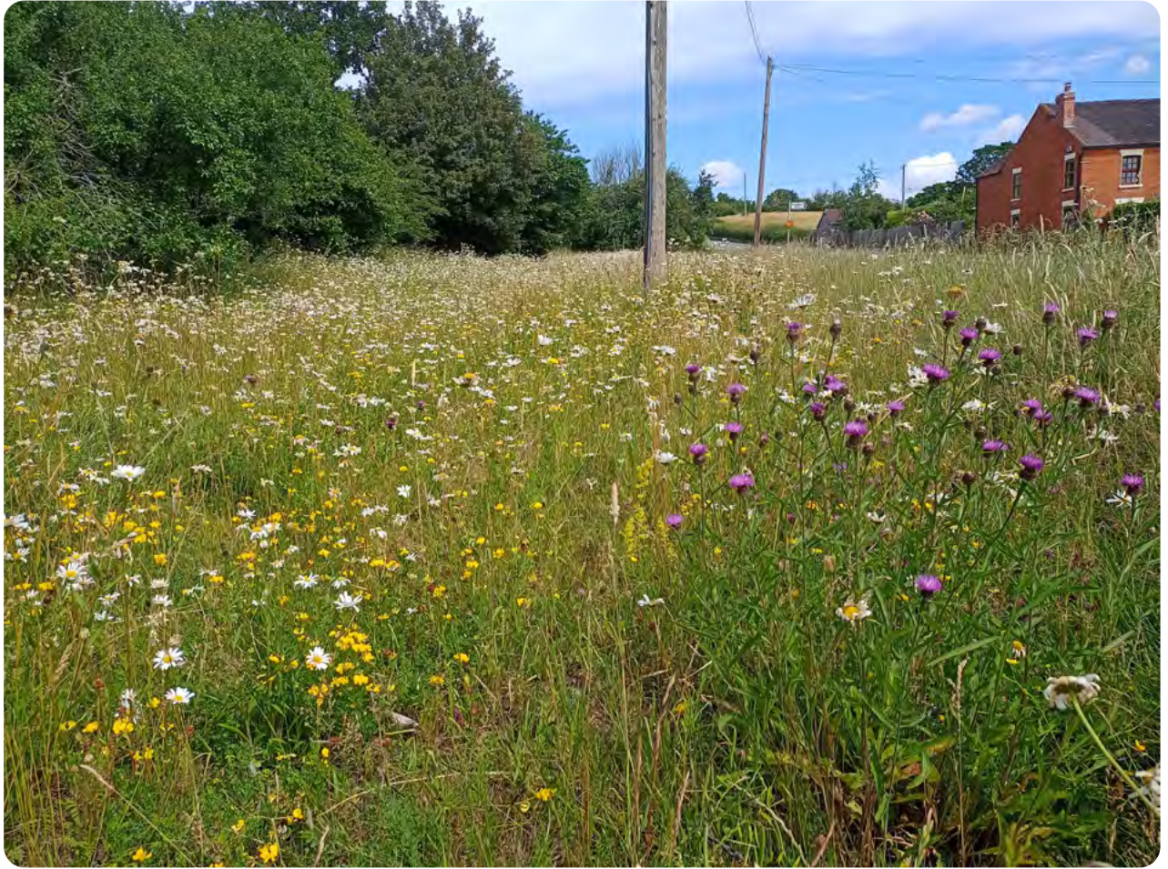
Roadside verge managed for wildlife, Castlemorton.