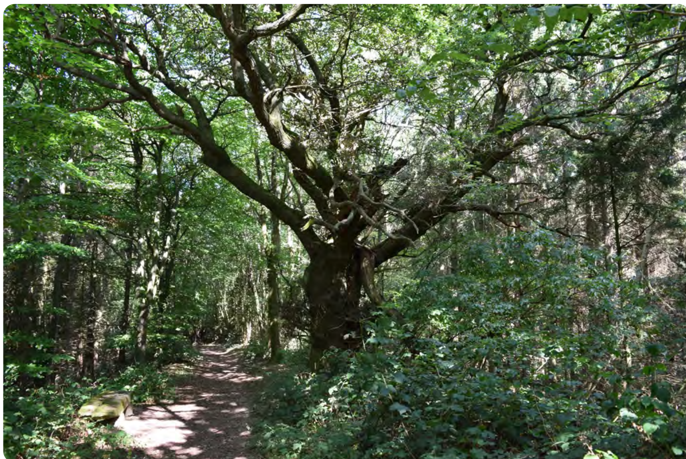
Plantation on Ancient Woodland, Suckley.

7.60 Trees have a huge significance in the National Landscape, contributing to the heritage and rural economy. Trees provide major ecosystem services to society, as well as a direct economic value and social amenity 55 . Trees can also help mitigate climate change by capturing and storing carbon. Woodland covers around 20% of the total National Landscape area. This consists mainly of small broadleaved woodlands on banks, ridges and hilltops, and hedgerows. There are larger woodlands covering more than 100 ha at Eastnor, Storridge/Alfrick and Bromesberrow. Alongside global trading and modifications to climate, new diseases and pests are affecting trees in the National Landscape. Defra has recently published its tree health resilience strategy. This explains how the government will work with others to protect England's tree population from these threats.