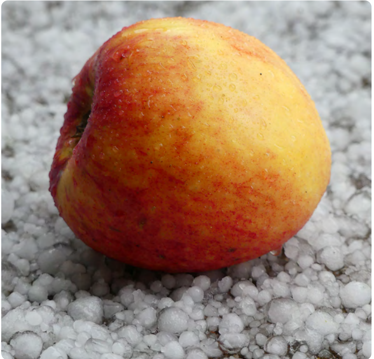
Unseasonable hail at apple harvest.