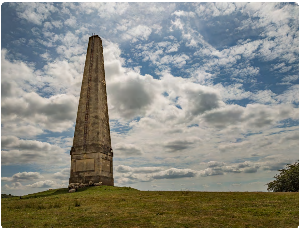
31. The obelisk, Eastnor