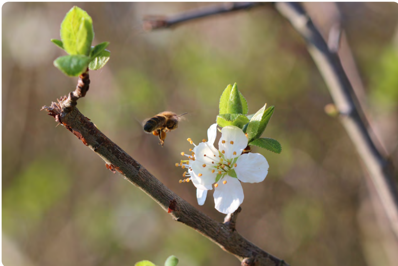
Bee on blossom.