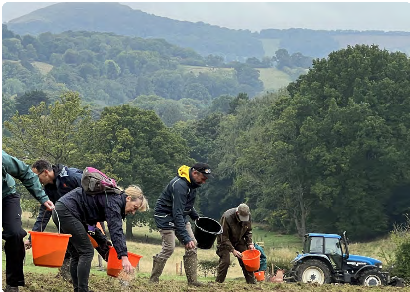
Volunteers restoring a meadow, Upper Colwall.