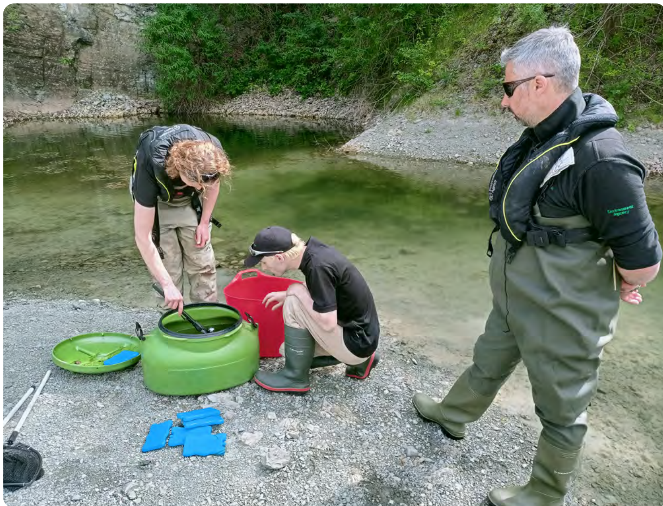
Establishing an ark site for White-clawed Crayfish.

NA1.4 National and local guidance – including guidance from Government Agencies and the Non-Native Species Secretariat – on invasive non-native species, pests and diseases should be followed and appropriate biosecurity measures promoted, for example: