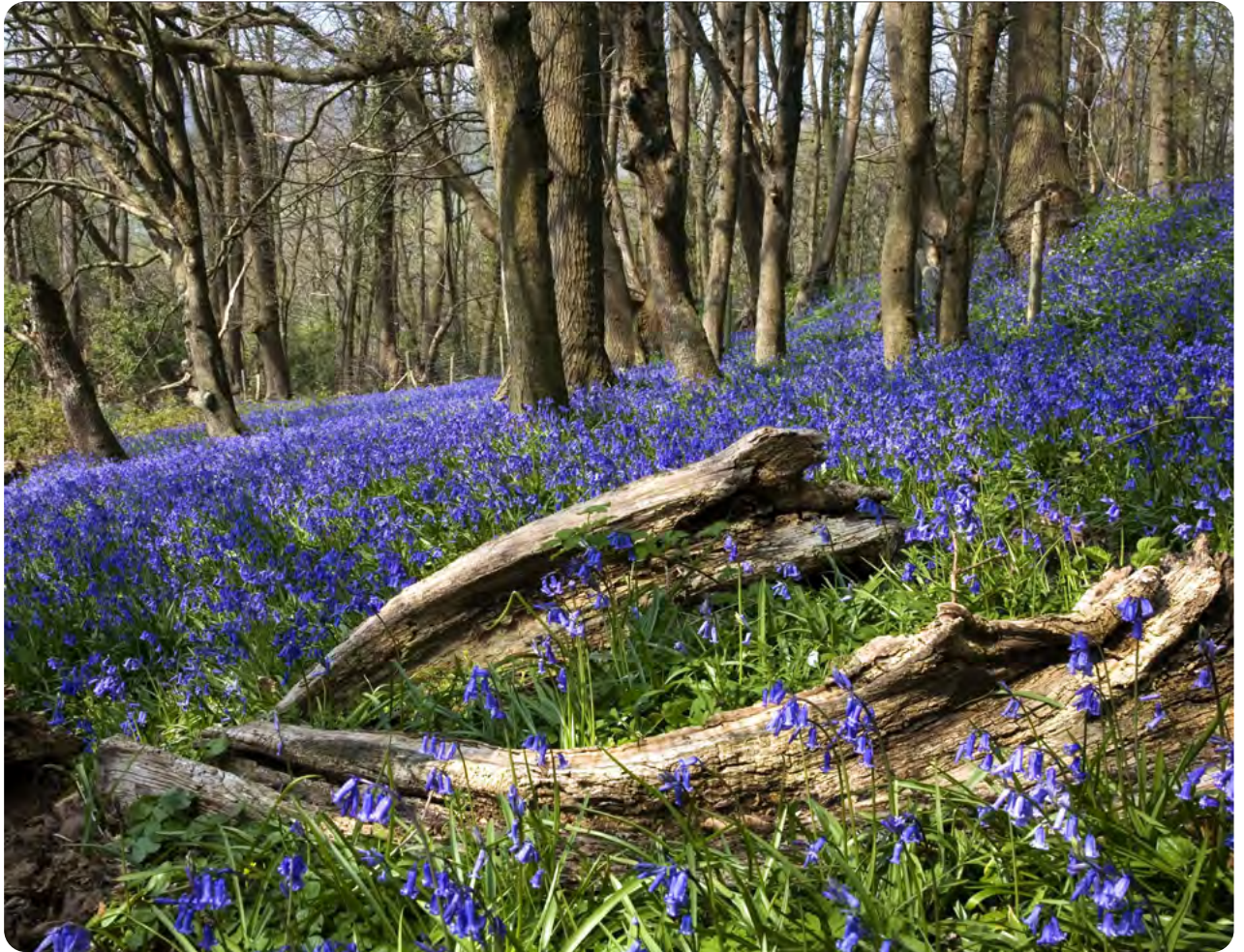
Bluebells, Knapp. © Paul Lane.