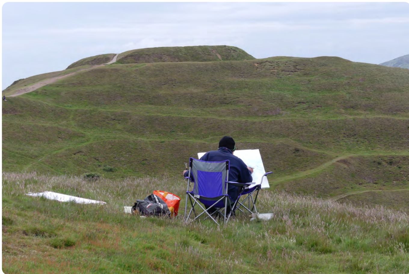
Landscape artist, British Camp.