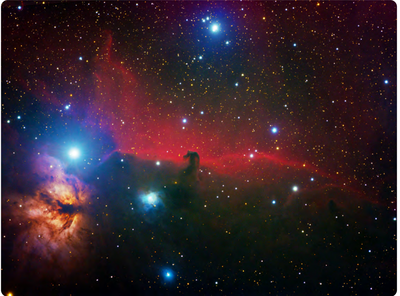
Horsehead and Flame nebula from Suckley

People can experience calmness and spiritual refreshment within the National Landscape, free from unnecessary noise, light and human induced disturbance.