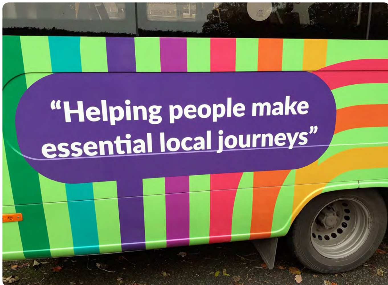
On-demand bus service, Worcestershire.