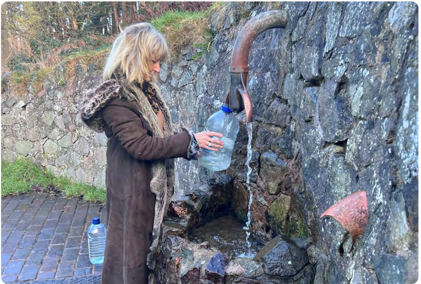
Collecting spring water, Hayslad.