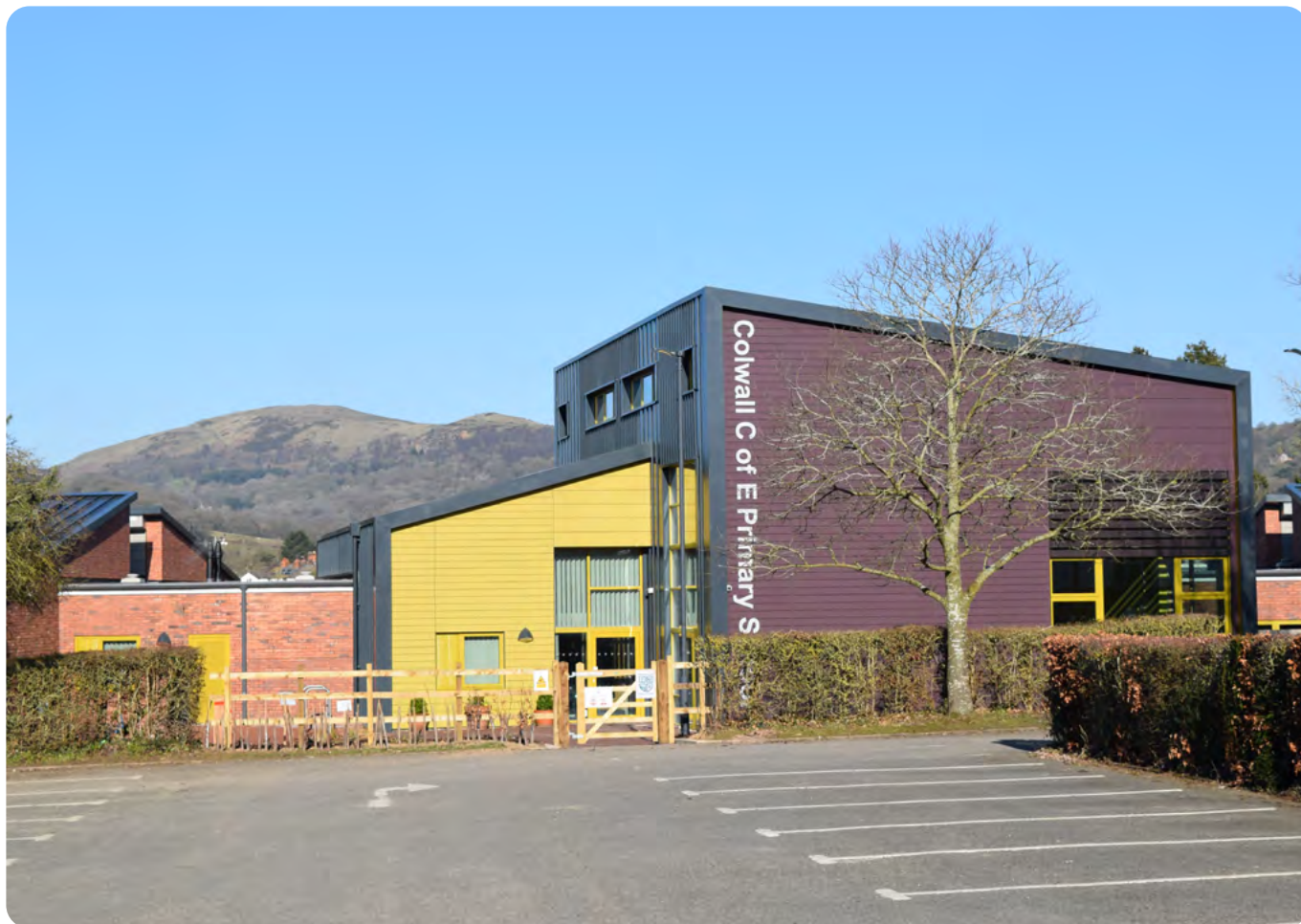
Primary School, Colwall.

PL7.4 The cumulative impacts of development proposals on the natural beauty of the National Landscape should be fully assessed and addressed in accordance with the National Landscape's Landscape Character Assessment, Landscape Strategy and Guidelines and any relevant position statement or guidance published by the Partnership.