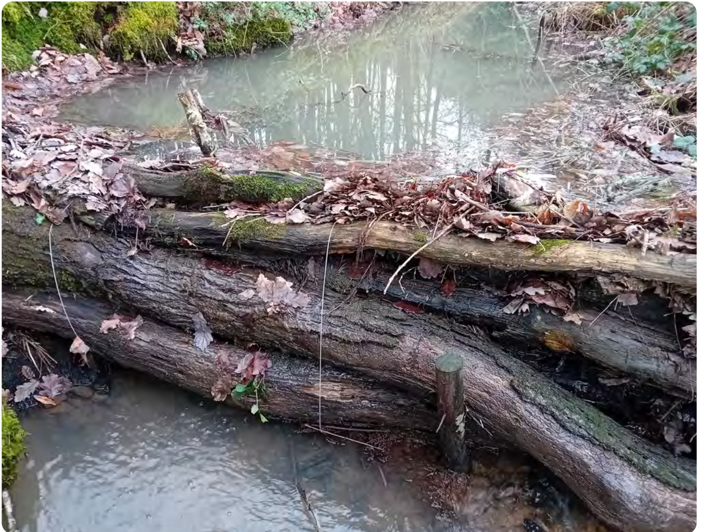
Leaky dam, Worcestershire.