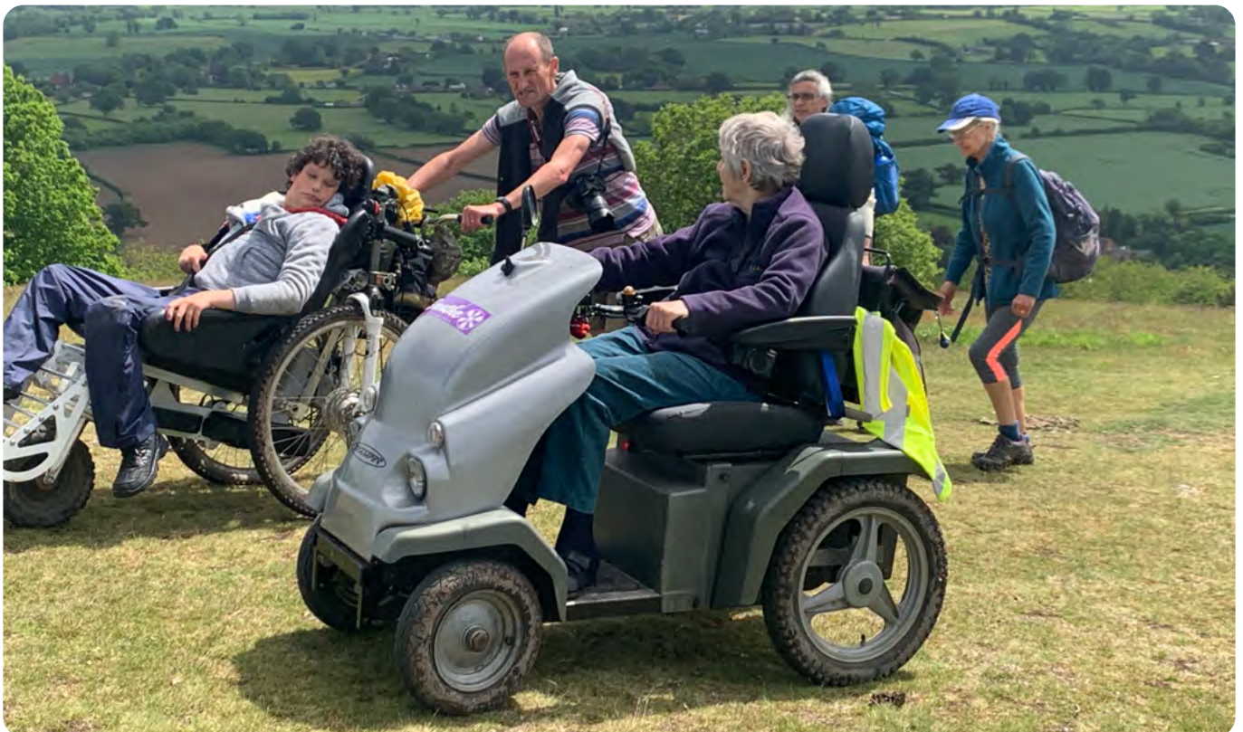
A Tramper expedition on the hills.