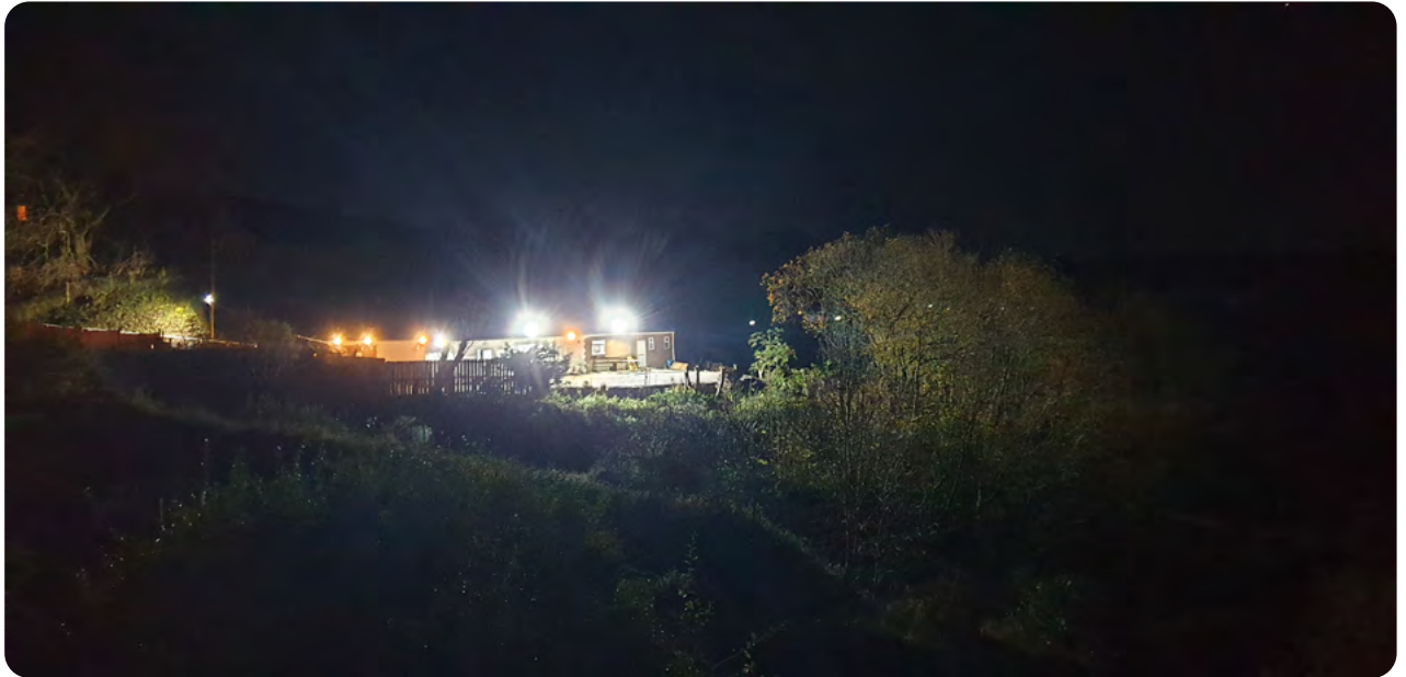
Light pollution, West Malvern.

7.35 Light pollution occurs when artificial light shines where it is neither wanted nor needed. In broad terms, there are three types of light pollution: