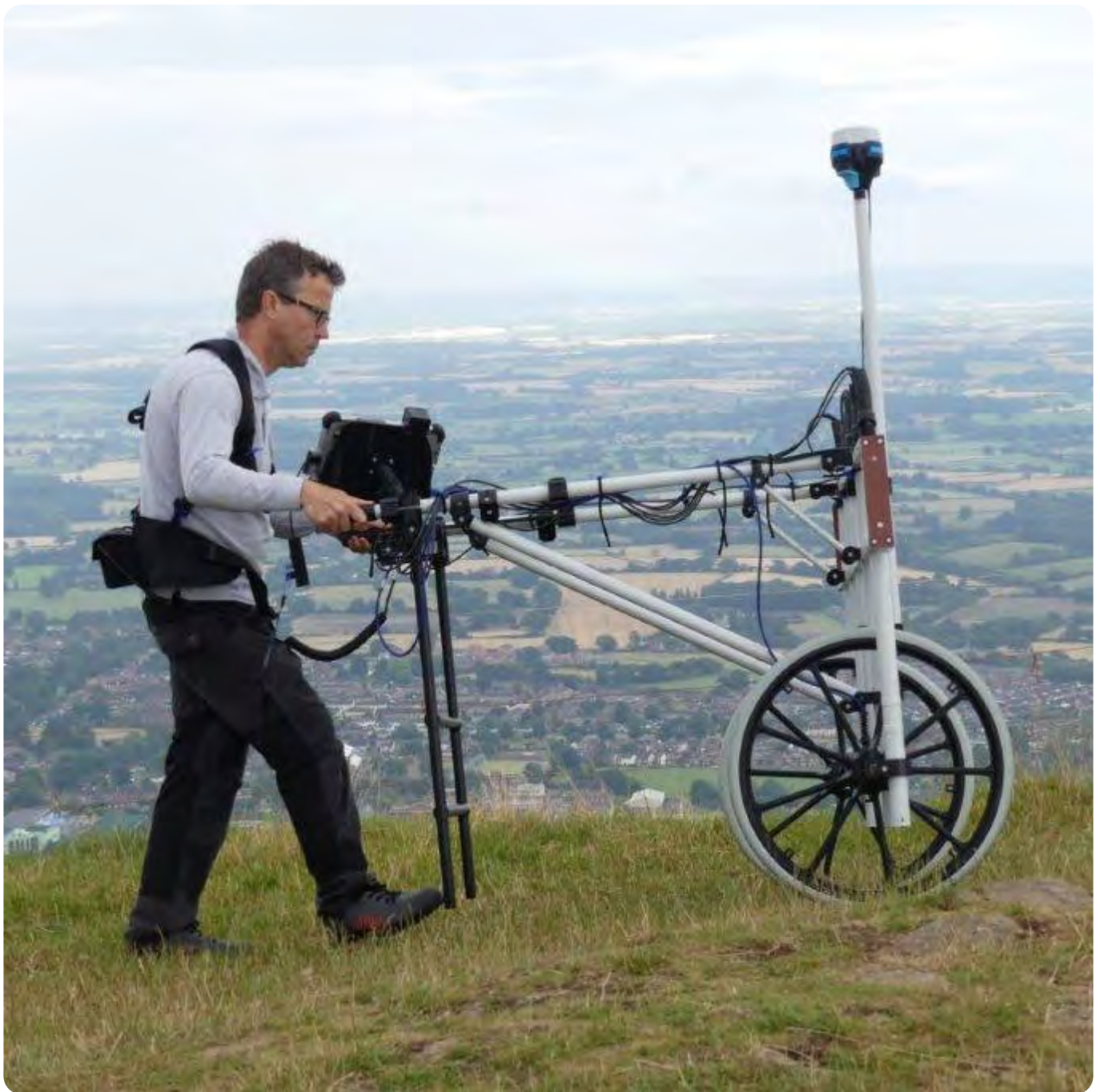
Data Collection with a magnetometer, Malvern Hills.