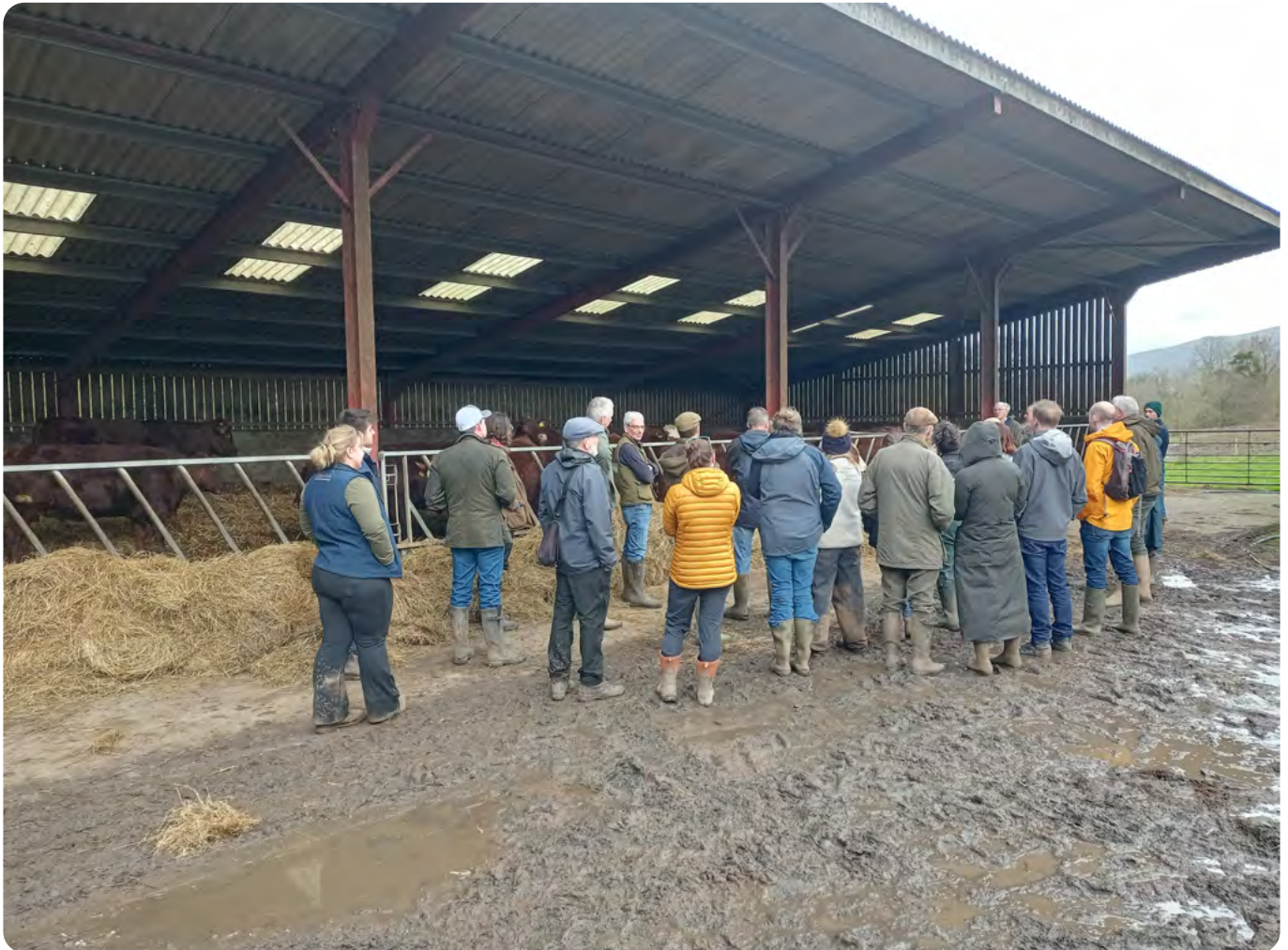
Landowner and manager event, Madresfield.

PE3.2 Support community initiatives that promote the creation and management of key habitats, appropriate renewable energy schemes, energy efficiency, recycling, community transport and community housing where there is evidenced need.