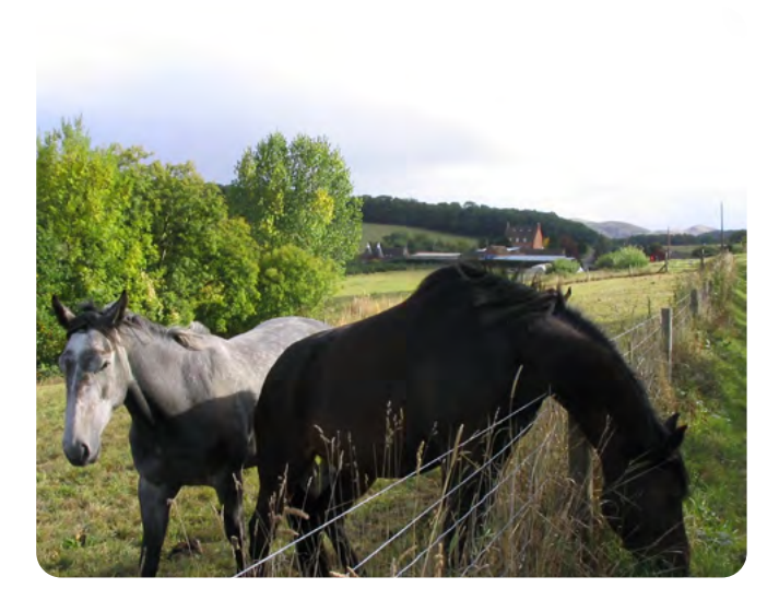
Simple post and wire fencing has the least visual intrusion on the landscape.

The surface materials of the ménage should. if possible, be dark in colour to avoid glare and to reduce general visibility but note that some dark sands may provide a riding surface which is unsuitable for use in an arena. Certain surfaces may not be suitable for sports horses jumping at higher levels and for dressage horses which are performing at an elite/professional level, although we would encourage darker materials surfaces wherever possible and any alternatives should be assessed on a case-by-case basis. Care should be taken to avoid materials often branded as 'recycled' (such as from carpet rubber or recycled tyres) as these may be harmful to the environment.