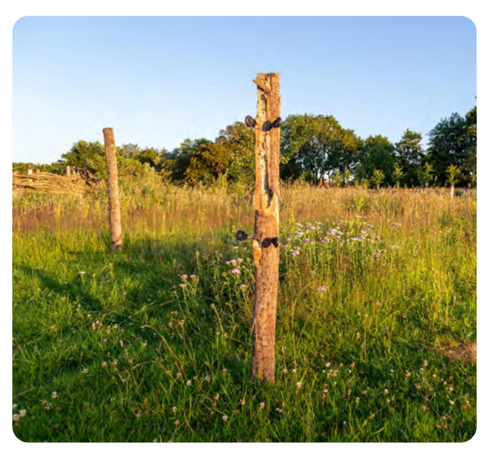
Horse grazed wild flower meadow.

The Malvern Hills National Landscape is an area with many important wildlife sites such as Sites of Special Scientific Interest (SSSIs), these are indicated on development plan proposal maps and should always be avoided both for development and for landscaping, although horses can sometimes be valuable grazers on such sites.