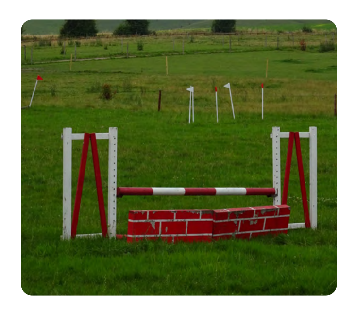
Brightly coloured jumps are visually intrusive.

Brightly coloured jumps left in position after use can be visually intrusive in open countryside. Planning conditions may be imposed that require jumps to be removed after use and stored off site. Jumps that are affixed to the ground do require planning permission and should preferably be constructed of unpainted natural materials e.g. for hunter trials and cross-country events. Ideally, jump wings should be coloured dark brown/black or another colour which ensures they do not stand out. The poles and fillers should also be of a colour finish that is unobtrusive and not brightly coloured. Wherever possible, poles and fillers should be stored overnight.