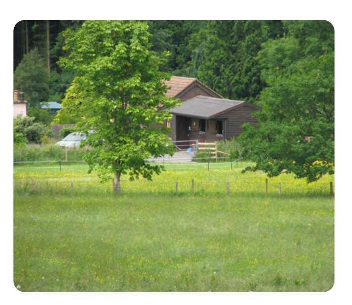
Stables well positioned near existing buildings and view softened by trees.

When developing in a new location the building(s) should be sited as inconspicuously as possible, so important viewpoints in the surrounding landscape should be identified to determine the visual impact of any development. Even small developments can affect the landscape and people's enjoyment of it. The Malvern Hills National Landscape Guidance on Identifying and Grading Views and Viewpoints provides non-technical advice to help people assess views and development impacts on them.