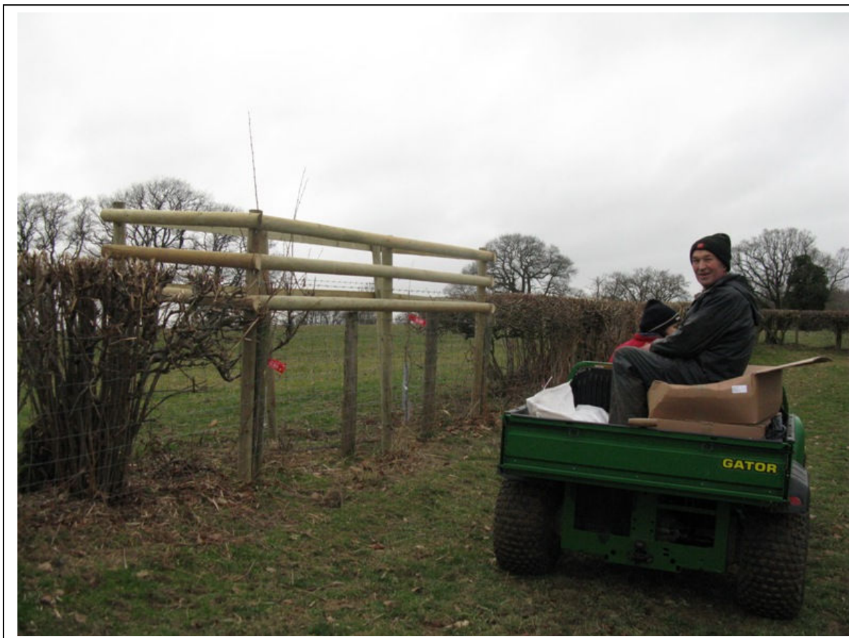
Below: the provenance of the Field Elm saplings