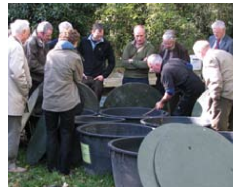
Right: Composting bins at the Malvern Hills Outdoor Education Centre