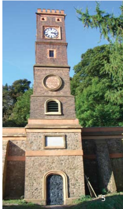
Top right: Barnards Green Trough Right: North Malvern Clock Tower