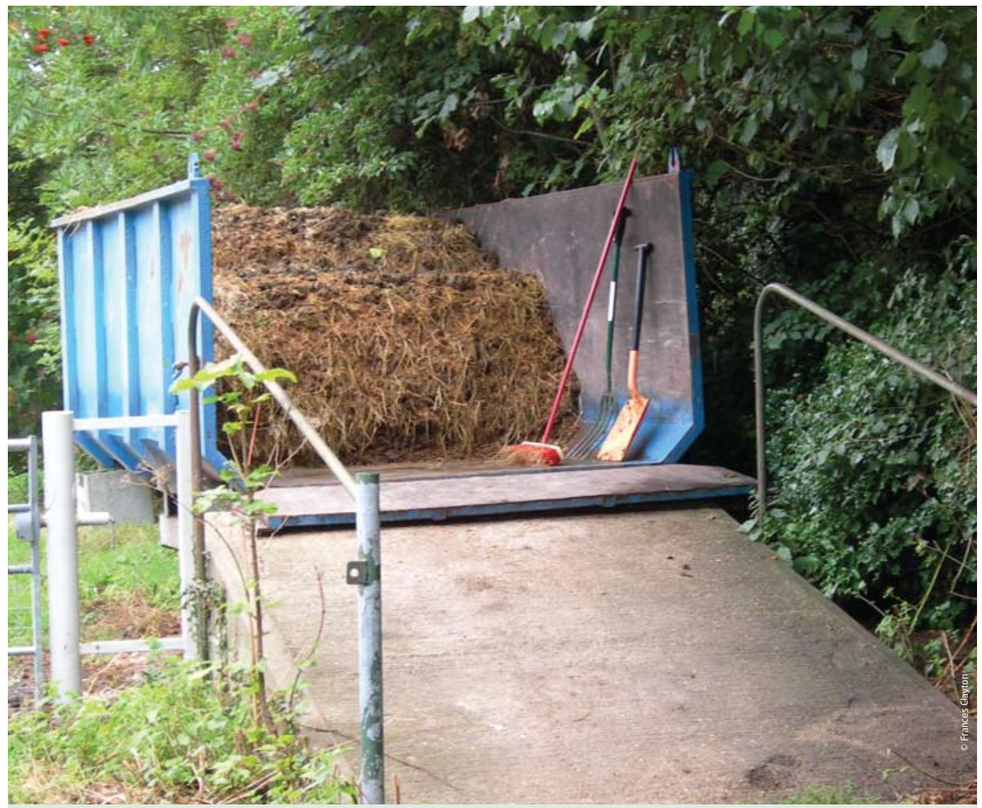
Manure storage at a livery yard ready for removal

You can use the recycling directory on www.wasterecycling.org.uk to search for facilities in your local area.