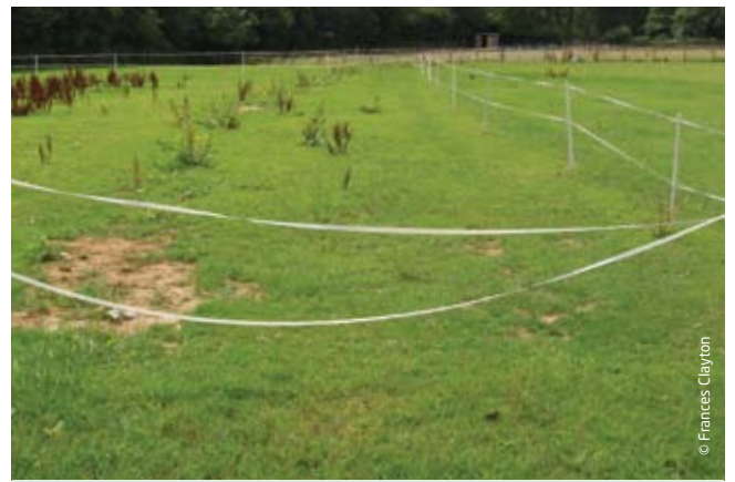
Visually insensitive electric tape