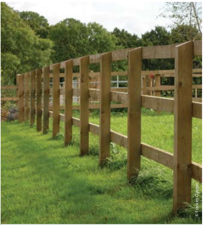
Visually insensitive ranch-style fencing