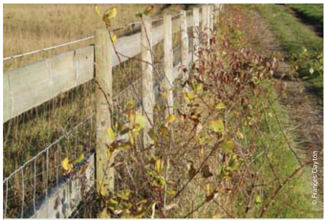
Hedging can screen fencing