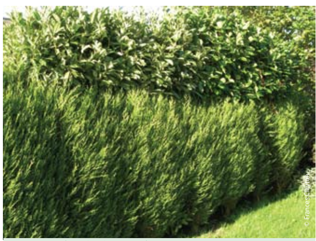
Inappropriate hedge species