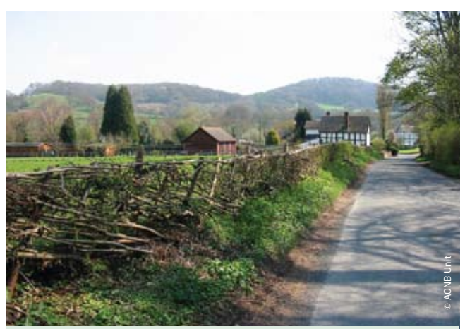
Newly laid hedge at Petty France

Look at established hedgerows and trees in your area to identify the species they contain and in what proportions. You can then try to replicate this with any new planting.