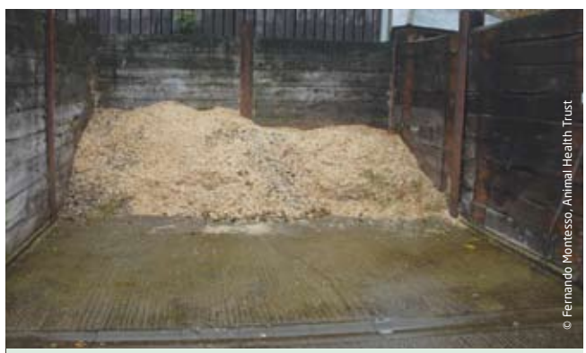
Permanent manure store

A well-constructed permanent manure store must therefore have a concrete base, which slopes to the back of the store (in the absence of a sealed underground tank). It should also have solid sides that prevent the muck spilling out and contaminating adjacent land. Ideally, the muck should be kept as dry as possible.