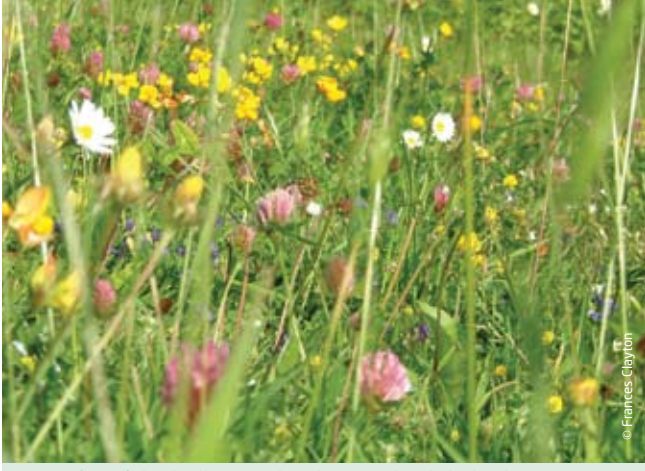
Species-rich chalk grassland grazed solely by horses

If you already have species rich grassland it will benefit from a slightly tailored maintenance regime. Think carefully before applying fertiliser as this will have a detrimental effect on valuable plant species and will reduce the diversity of the grassland sward. This could in turn affect your horse.