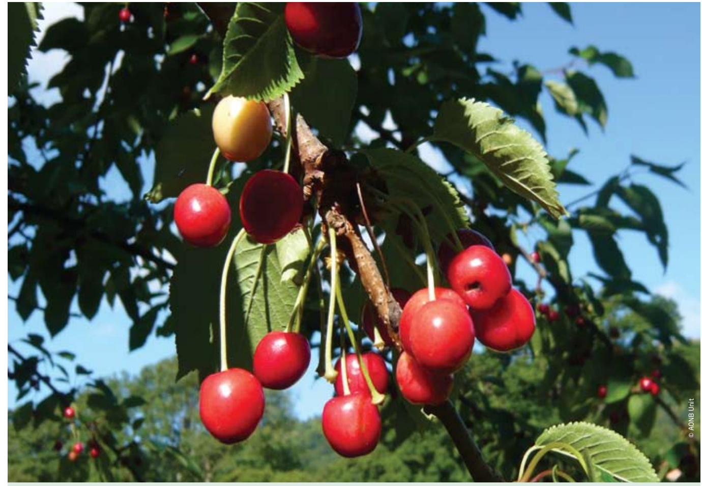
Leave berries on trees and hedges as long as possible to provide winter food for birds

A brief summary of the law is provided in the leaflet, 'The Hedgerows Regulations: Your questions answered'. More detailed guidance is available in 'The Hedgerows Regulations 1997: A guide to the law and good practice'. Both are available free of charge by emailing farmland.conservation@defra.gsi.gov.uk