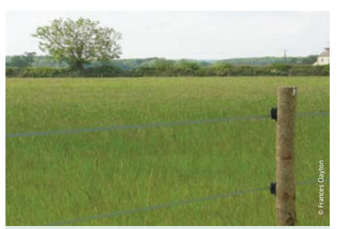
Dark electric tape and wooden posts providing visually sensitive fencing