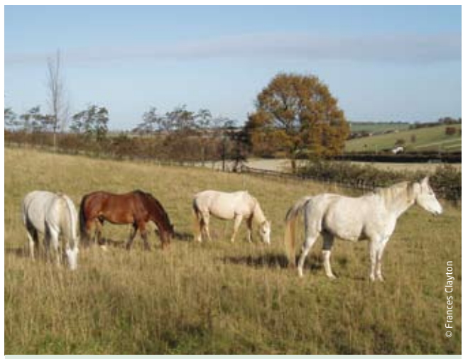
Horses grazing on standing hay

supplementary feed. However, this can result in behavioural problems. Gastric ulcers and lacerations can also result if horses go for more than four hours without some forage<sup>2</sup>.