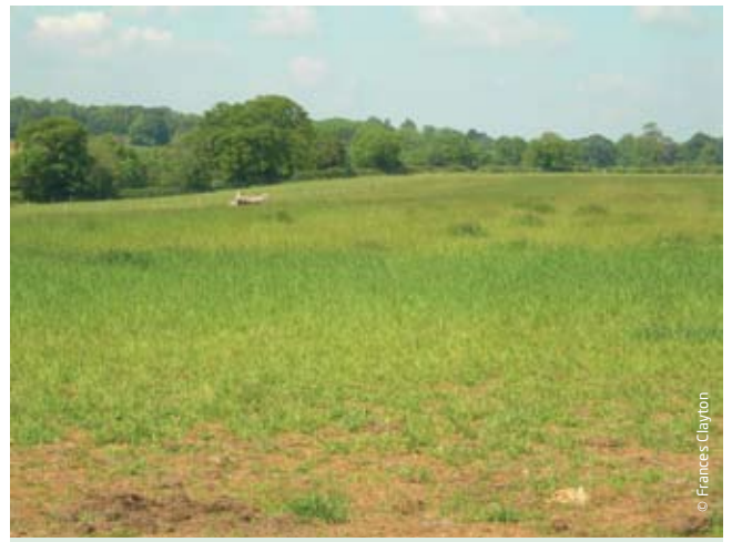
Field size should respect landscape character