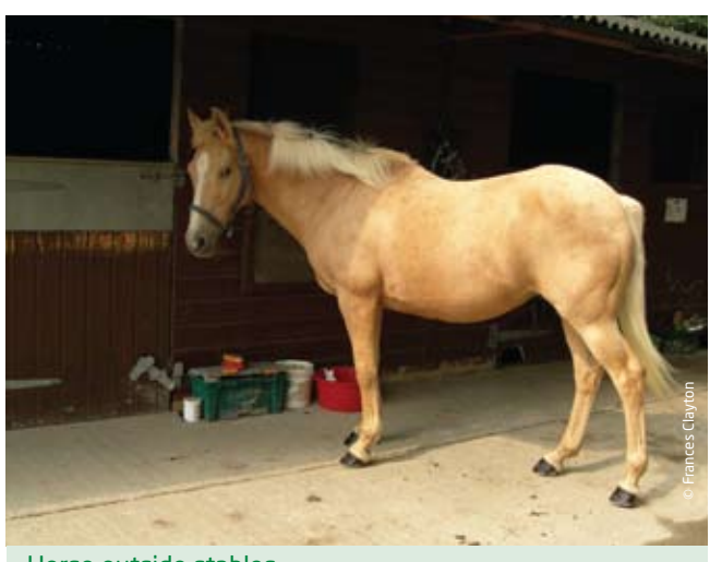
Horse outside stables