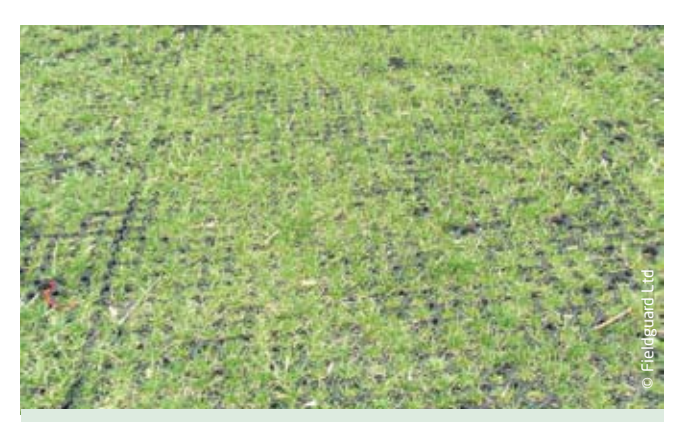
Grass matting can help to reduce poaching around gateways