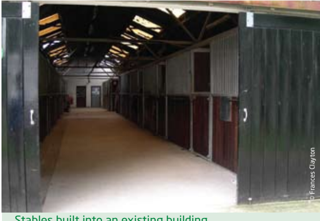
Stables built into an existing building