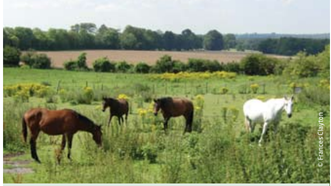
Weed encroachment into pasture

Poisonous weeds such as ragwort should be removed. Ideally this should be done by pulling them out by hand (wearing gloves), followed immediately by burning. Ragwort is more palatable, and therefore more dangerous, when it is dry so take particular care not to leave any within reach of horses.