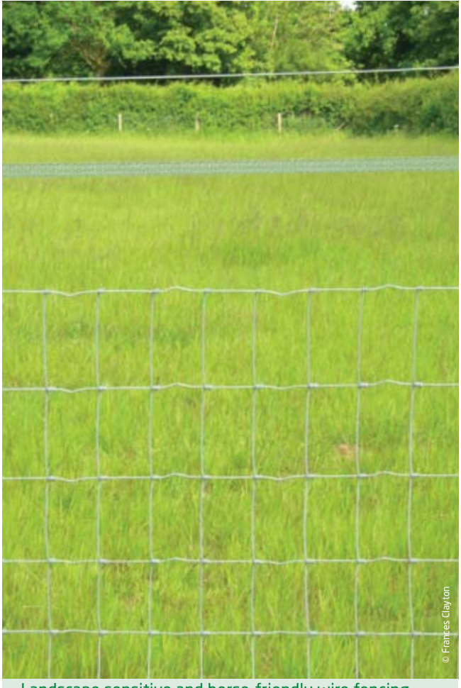
Landscape sensitive and horse-friendly wire fencing