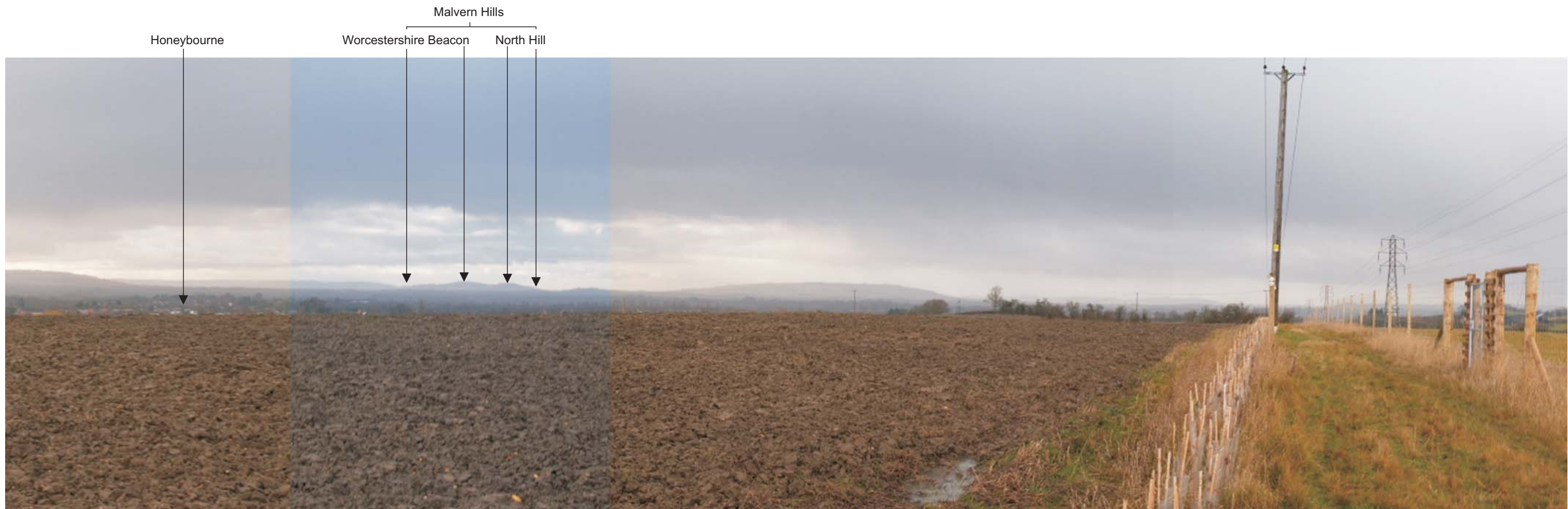
Viewpoint 5: View from Baylis's Hill