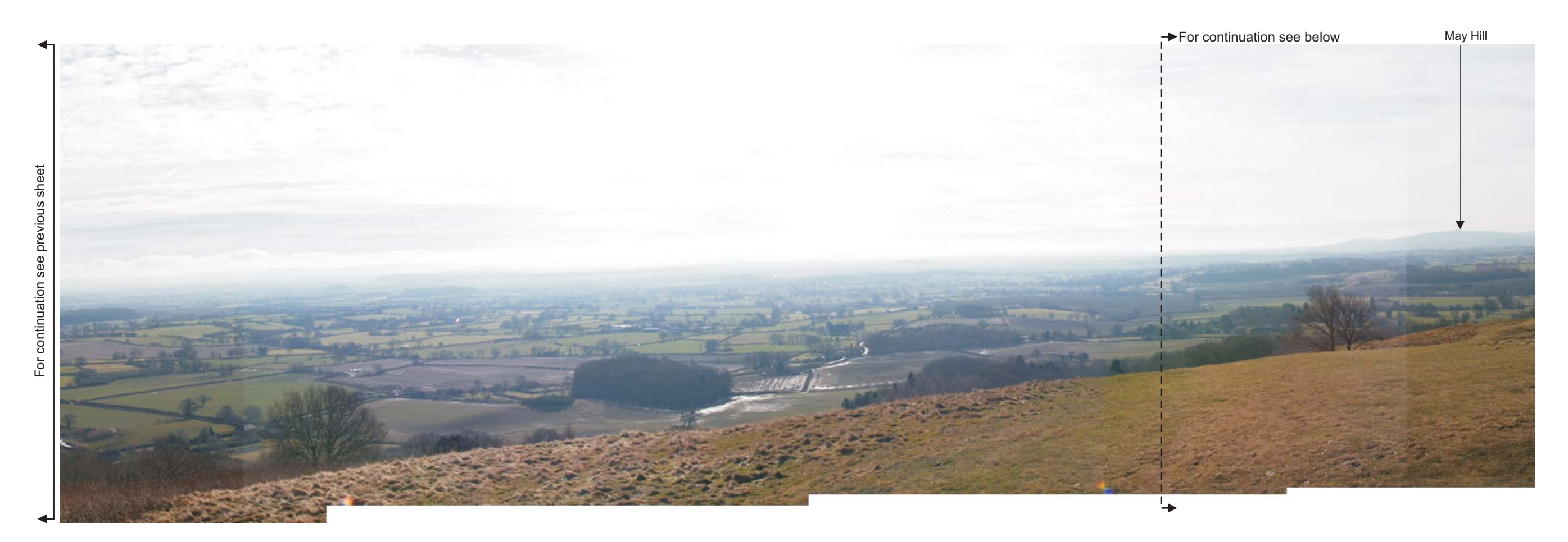
Viewpoint 50 (S): View from Chase End Hill continued (looking east to south)