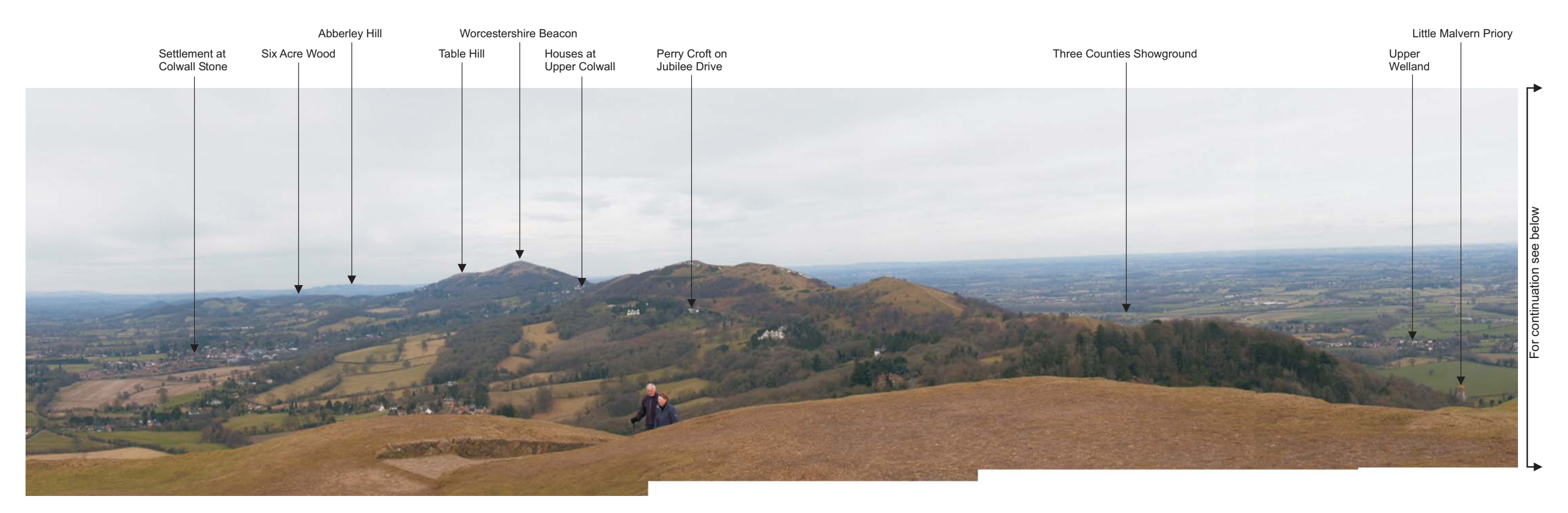
Viewpoint 49 (K): View from Herefordshire Beacon (looking north to east)