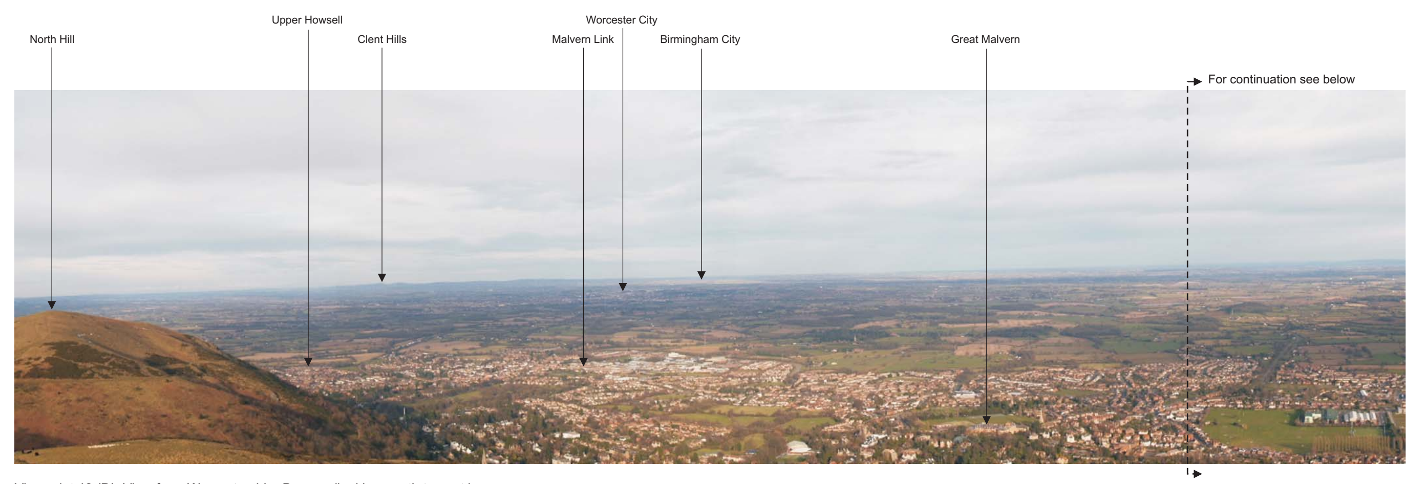
Viewpoint 48 (D): View from Worcestershire Beacon (looking north to east )