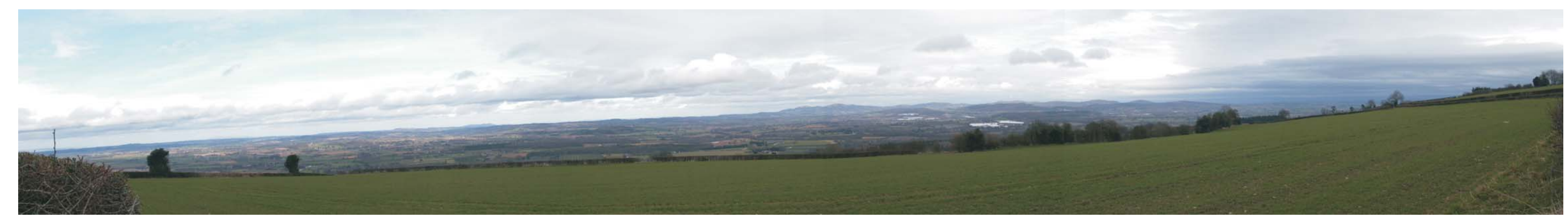
Viewpoint 45: View from a track near Durlow Common (Whole panorama at reduced size)