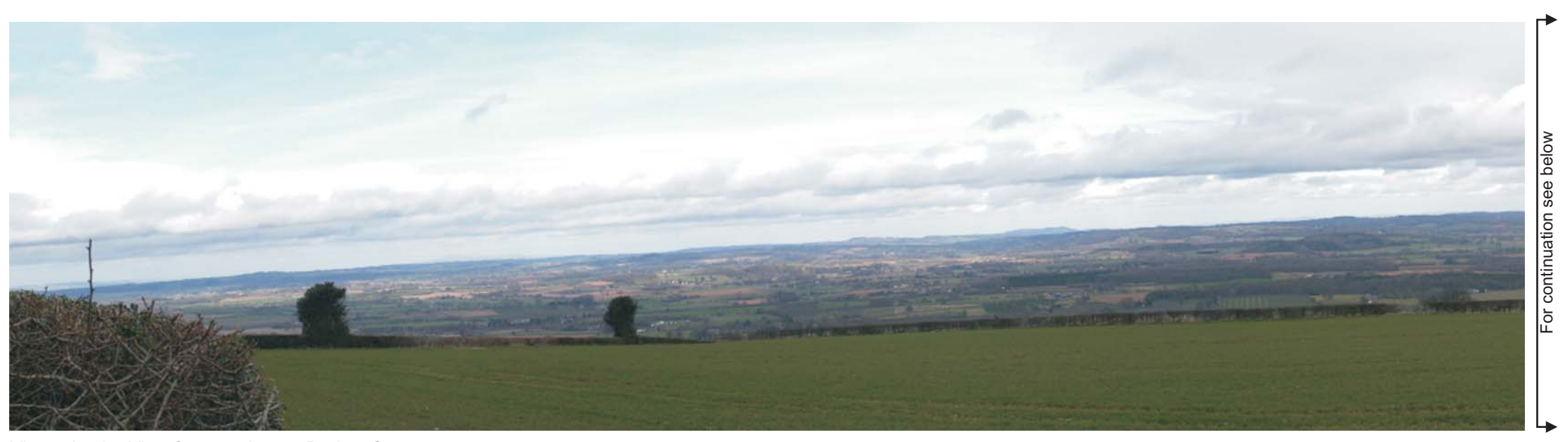
Viewpoint 45: View from track near Durlow Common