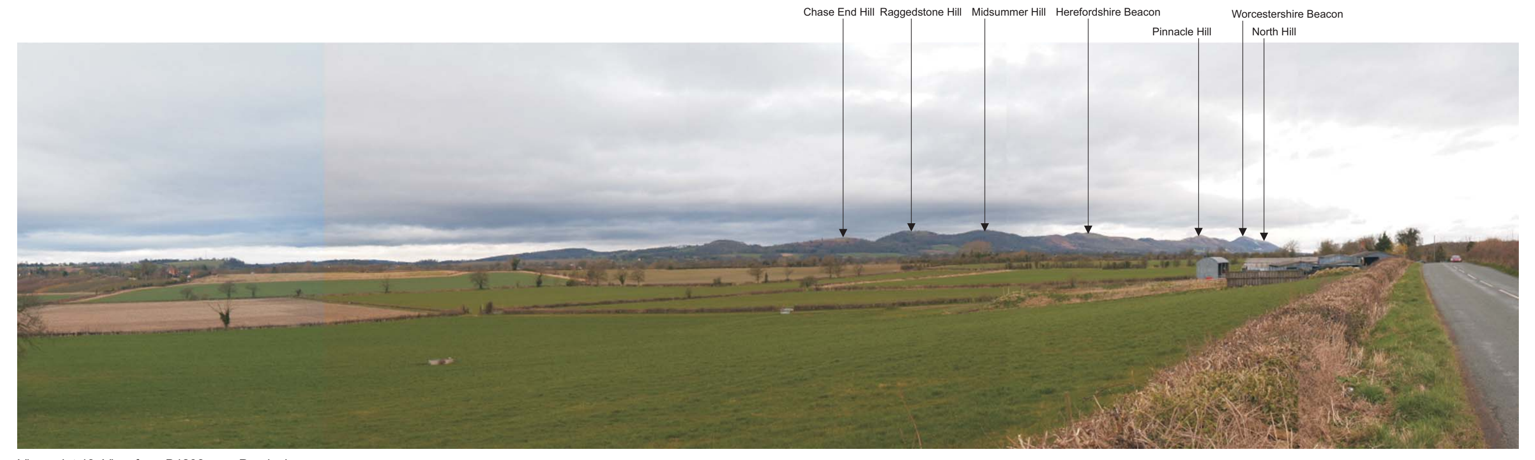
Viewpoint 43: View from B4208 near Pendock