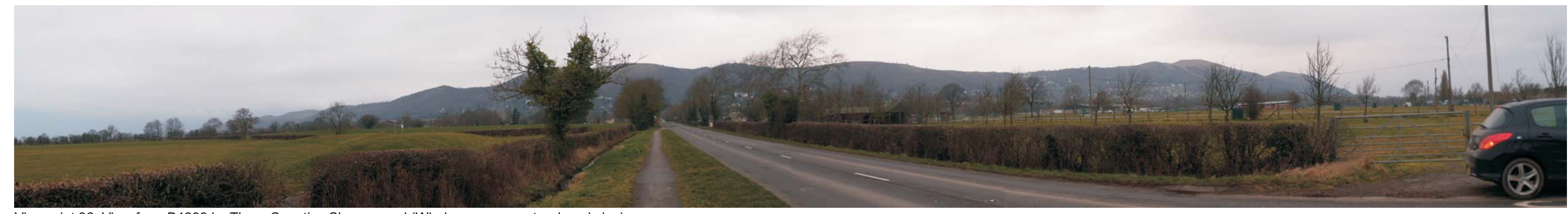
Viewpoint 36: View from B4209 by Three Counties Showground (Whole panorama at reduced size)