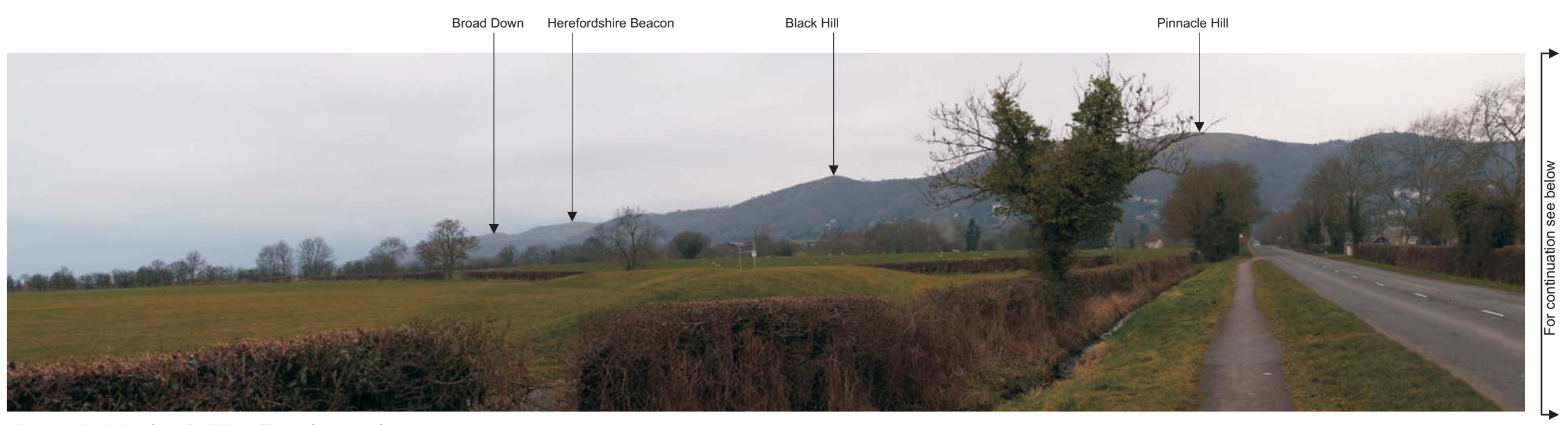
Viewpoint 36: View from B4209 by Three Counties Showground