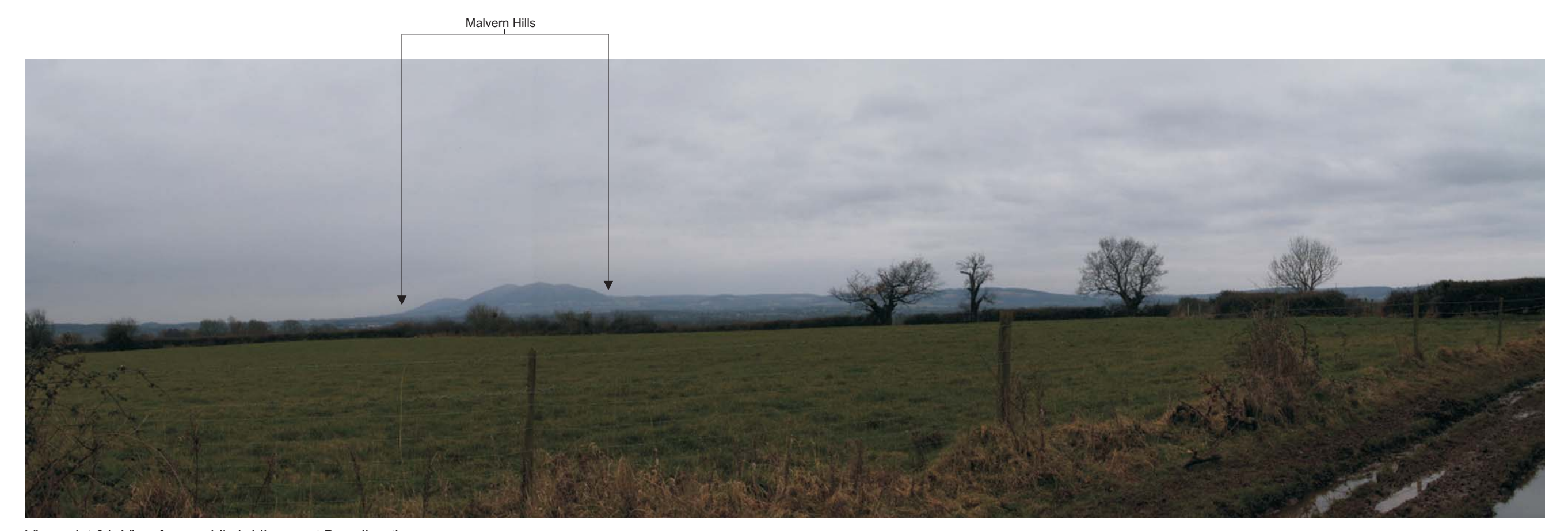
Viewpoint 31: View from public bridleway at Broadheath