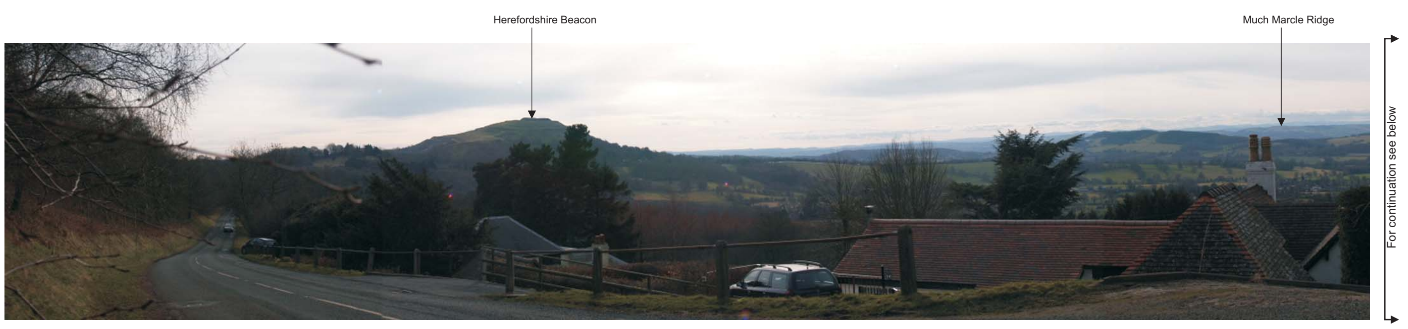
Viewpoint 24: View from Jubilee Drive (B4323), by Perrycroft