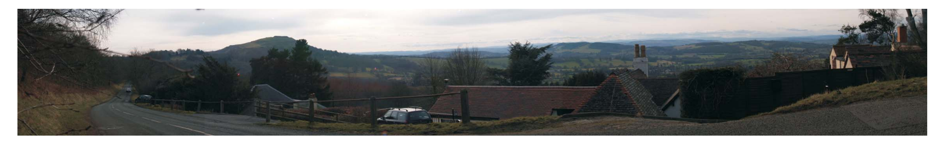
Viewpoint 24: View from Jubilee Drive (B4323), by Perrycroft (Whole panorama at reduced size)