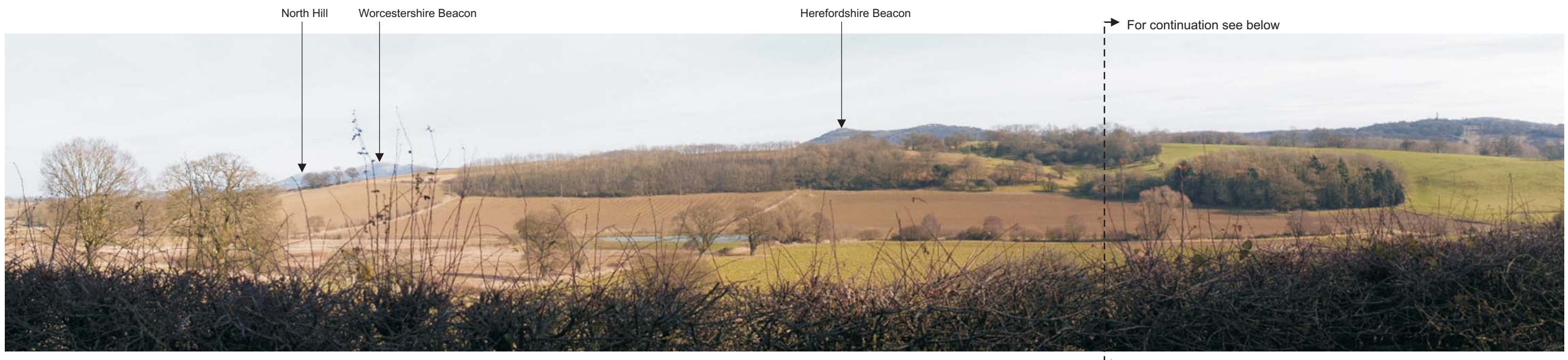
Viewpoint 22: View from A438 north-west of Eastnor