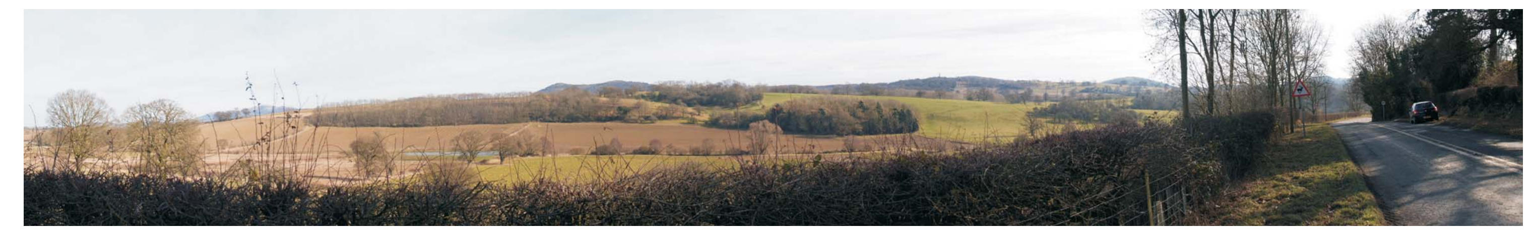
Viewpoint 22: View from A438 north-west of Eastnor (Whole panorama at reduced size)