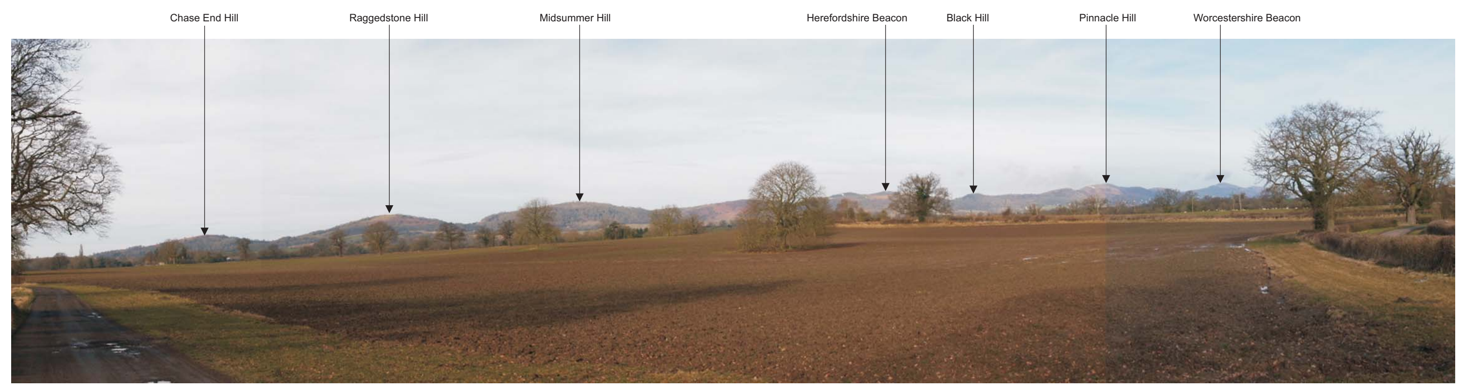
Viewpoint 21: View from public footpath at Birtsmorton