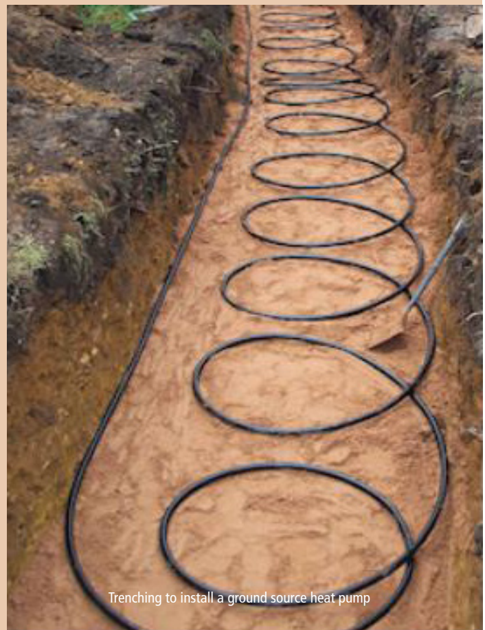
Trenching to install a ground source heat pump