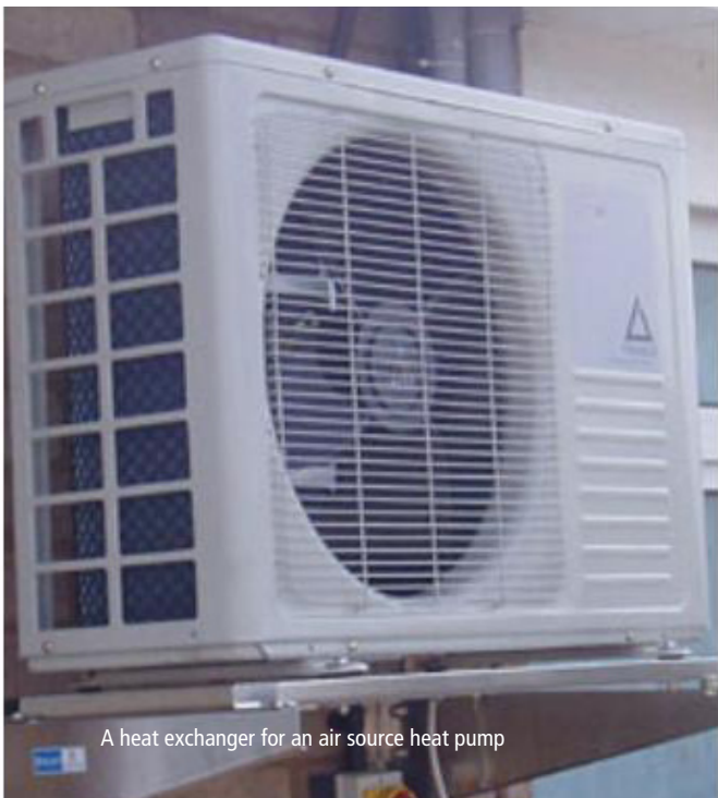
A heat exchanger for an air source heat pump