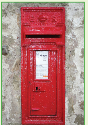
Edward VII Post Box