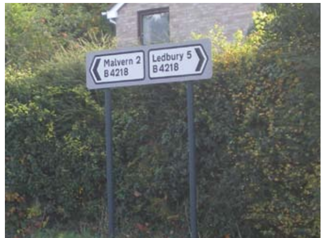
Camouflaged poles reduce visual impact