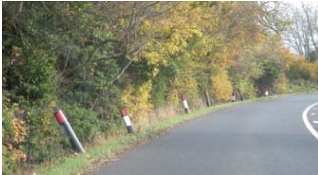
Posts should be clean and vertical

Strong geometrical shapes, such as road signs, are not natural and should be avoided in the AONB. When they are necessary their impact can be minimised if they are clean and vertical. Signs and posts that are not vertical ‘catch the eye’ more than is useful. Signs should be clean, as those obscured by dirt are more likely to be ignored.