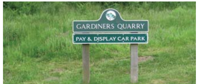
A well-designed name plate

Street name plates are not traffic signs so are not regulated by TSRGD. They are usually the responsibility of the district council. Aside from the primary aim of identifying the name of a street, they can also help create an identity and character of an area. Sensitive colour coding of signs to match with other street furniture, or incorporating a specific logo onto the sign can help a visitor identify a particular area of interest. The ‘standard’ in the Malvern Hills AONB is white on green; this should be followed in the absence of a locally distinctive alternative. This also matches the style used by the Malvern Hills Conservators (as shown below).