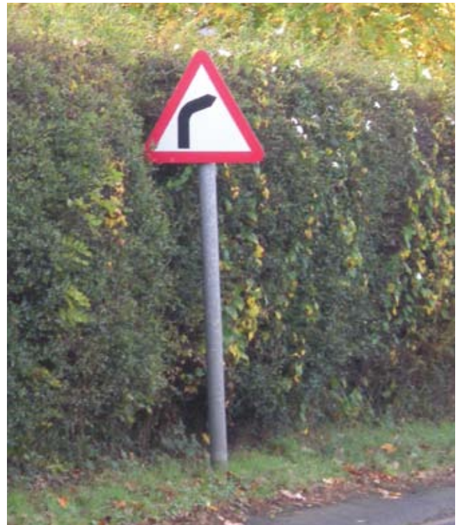
Shorter posts can reduce the detrimental impact of signs

If, as on the 'bend ahead' sign (above right), a 114.3mm post is used, only one-fifth of the visible area is useful. With this backdrop, if a 76mm post were used and painted green the impact would be greatly reduced – as can be seen with the camouflaged posts opposite.