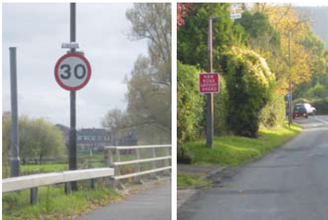
Redundant signs and posts spoil the view

Spare posts should be removed immediately after the sign is removed. Although good use has been made of the lighting column (in the photograph below left), unless the original post is removed nothing is gained. Temporary signs should also be removed as early as possible (see photograph, below right). Posts without signs are an illegal obstruction in the highway.