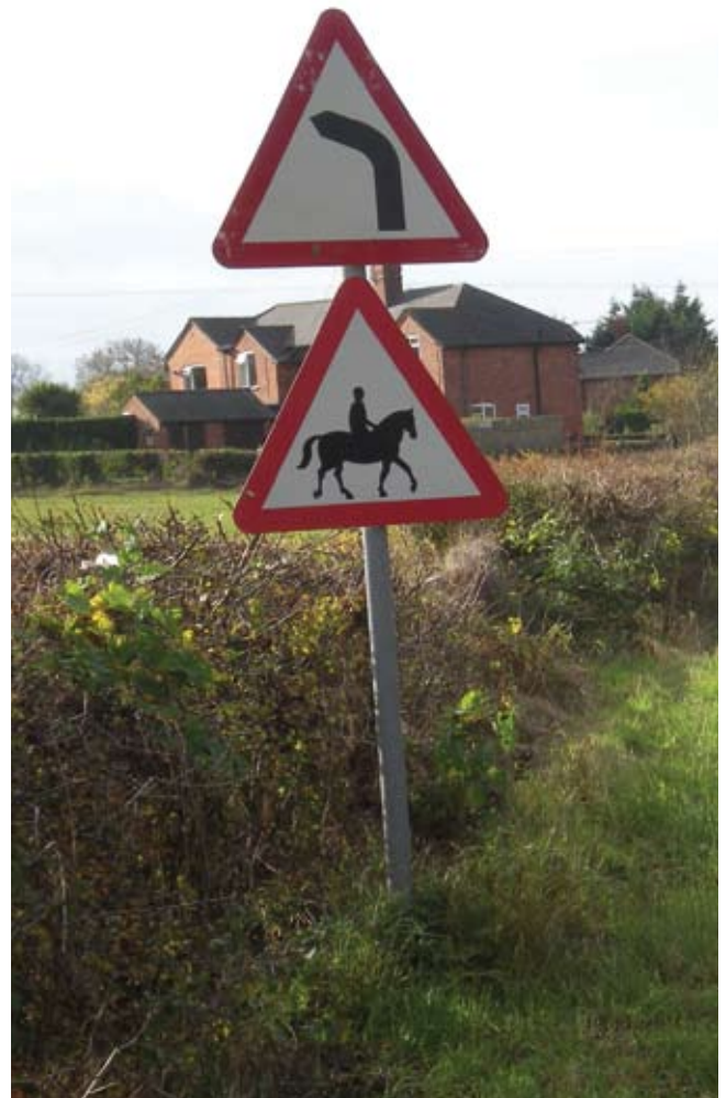
Fewer posts sometimes means breaking the skyline

It is not always possible to avoid breaking the sky line, particularly if two signs are mounted on the same post. As in the photo below, it might be preferable to break the sky line rather than have two signs mounted separately.