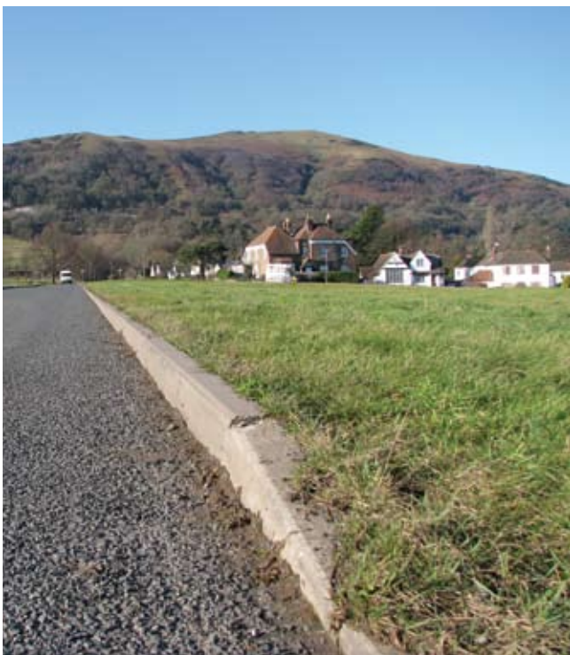
Kerbing in rural areas leads to suburbanisation of the countryside

Where positive drainage is required it is usual to provide kerbs although this is not essential except where longitudinal gradients are poor. In these cases filter drains may be a less intrusive solution. On minor roads, small grips (transverse trenches) properly maintained should be adequate drainage.