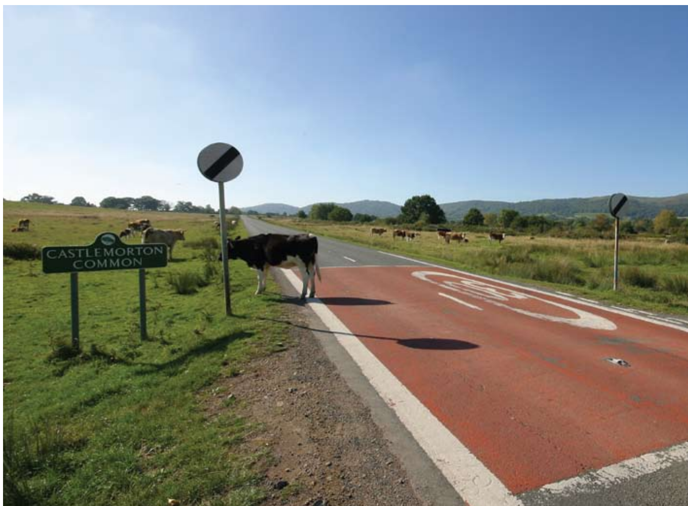
Highways design issues in a special landscape

Many environmental factors must be taken into account when planning works, whatever their size. The cumulative impacts of even seemingly small, piecemeal highway works can have a significant detrimental effect on the biodiversity, local landscape and natural beauty of the area over a period of time. An example of this is when 'roadside clutter' accumulates. In such cases even minor works present an opportunity to rationalise clutter and bring about improvements in the AONB's visual quality.