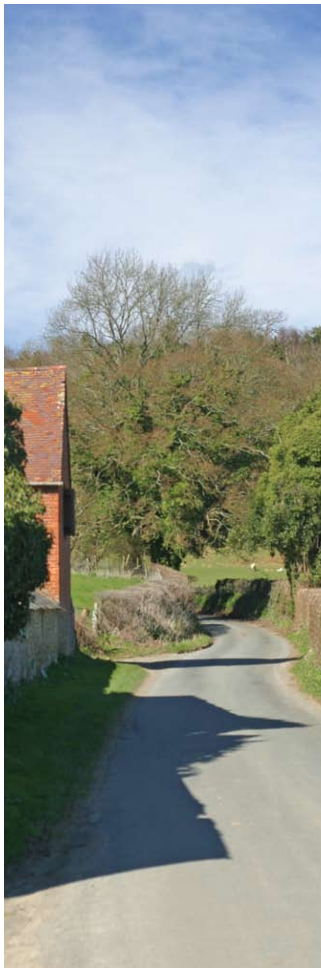
Rural roads are an integral part of the AONB landscape