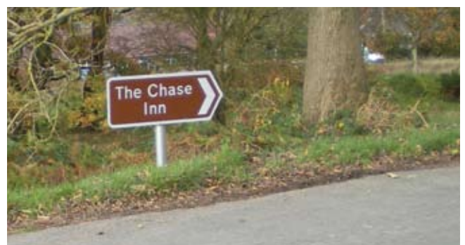
Sign with low mounting height

Use the lowest possible mounting height. The sign's impact would be further reduced if the post were painted green.