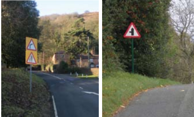
A well-placed sign may have more effect than intrusive backboards

You should not use backboards unless it can be demonstrated that they are essential. Clean retro-reflective signs show up well against most backdrops. Backboards may be necessary in exceptional cases where justified by accident statistics. Often placing a standard sign against a contrasting background increases its visual effect, as evidenced in the photo below.