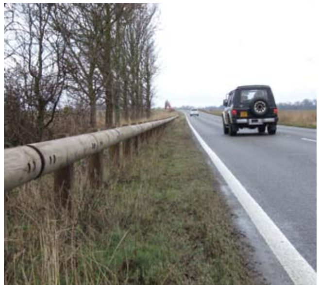
Timber clad barriers are usually preferable to metal

Timber clad barriers are now available that have far less visual impact.