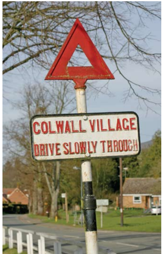
A traditional road sign

The CROW Act places a requirement on highway authorities to consider the conservation and enhancement of the AONB in everything they do that affects the area. This means that, to satisfy the legislation, policies that a highway authority generally applies across its area must be specifically reviewed before being used in the AONB. The organisations covered by the Act are outlined in Appendix 1.