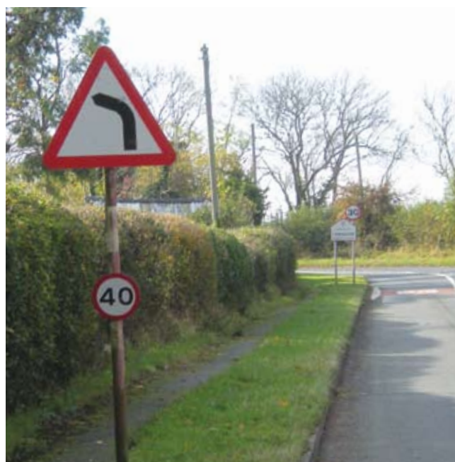
Review old signage in the light of new schemes

For example, in the photo below, the 'bend ahead' sign may not be necessary as the bend is now in a 30 mph limit, the motorist has been in a 40 mph limit for some distance, and a gateway feature has been added.