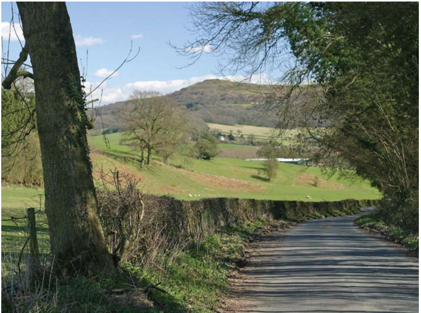
Tranquil, rural road in the AONB

Many local authorities have out-sourced much of their day to day work, with the contractor following a set of rules that allows little room or advantage to taking the difficult decisions of doing less, or of doing nothing. The purpose of this guidance is to assist with those difficult decisions.