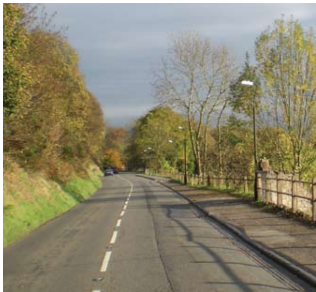
Painted lighting columns can blend with the background

Painting lighting columns can dramatically reduce their impact. The columns in the photograph below are almost totally lost in the background and only the luminaire hoods are noticeable. The hoods could also have been painted.