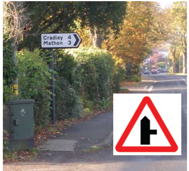
A flag sign can be more effective than a warning sign

Flag signs should be used to indicate side roads. They give more information, positively identify the location of the side road, and are less intrusive than Dia 506.1 'side road ahead' which, although giving a warning, is of limited value.