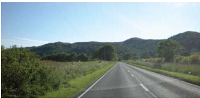
Avoid edge lines where possible

Road edge marking with a continuous white line should not be provided in the AONB unless there is evidence that motorists are failing to stay on the carriageway. Edge lines, like centre lines, encourage speed.