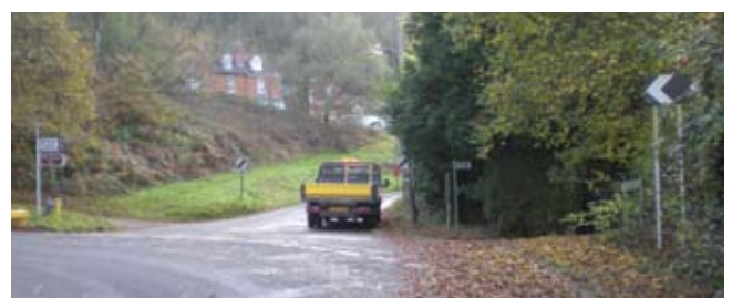
Minimise sign clutter where possible

Sign clutter grows with time when additional signs are added without consideration of existing signs and each new sign has its own post. You should omit all but the most essential signs that are mandatory or can be justified in the context of the AONB.