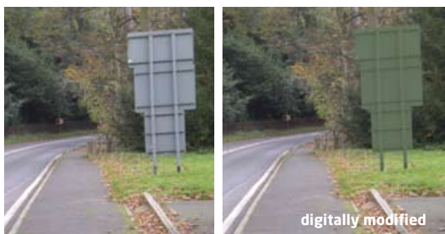
Green backed signs can be less obtrusive

Similarly, painting the rear of signs an appropriate colour can greatly reduce their impact, as the images below illustrate.