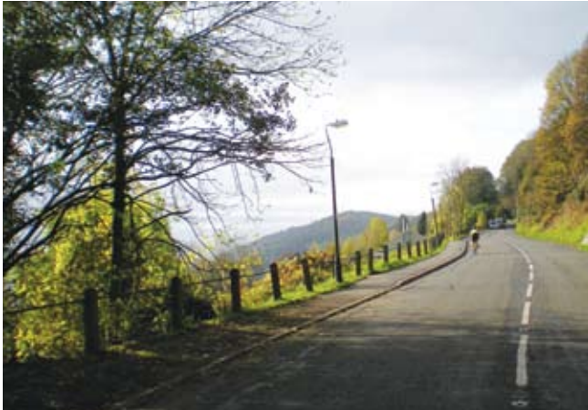
Traditional steel and concrete barriers

There is a considerable amount of single rail tubular steel and concrete post fencing in the Malvern Hills AONB. While it may not be the most attractive it has become part of the scene. Provided the posts are not too white this fencing is more acceptable than introducing other fence types. In view of the low traffic flows and speeds, in many cases this will be sufficient to act as the vehicle restraint system and provides a higher pedestrian containment than timber clad barrier restraint systems.