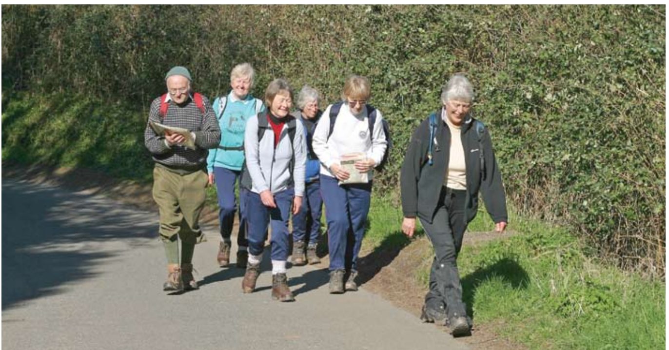
Recreational use of lanes in the AONB is common

New routes should not be provided without consultation with the AONB Partnership and local communities. The surface treatment of new and existing routes should be chosen with care to avoid urbanising the landscape.