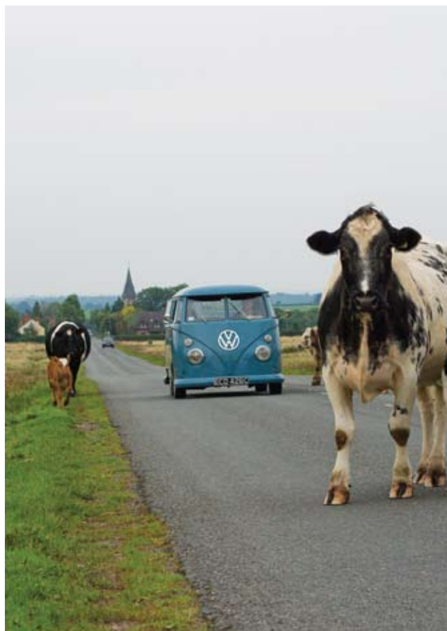
Many of the AONB's roads are minor

Consultation with the AONB Partnership: Even small changes in design and layout can dramatically change the impact of the work that is being undertaken. It is therefore difficult to be prescriptive about the level of work that needs to be passed to the AONB Partnership for comment. As relatively small amounts of highway work is carried out in the AONB it would initially be helpful if the AONB Partnership is consulted on all proposed work. This may be as part of a yearly programme of works or similar information that is prepared for other reasons. This approach would allow the guidance to be developed and any lessons incorporated within it. There may be less need to consult with the AONB Partnership over time.