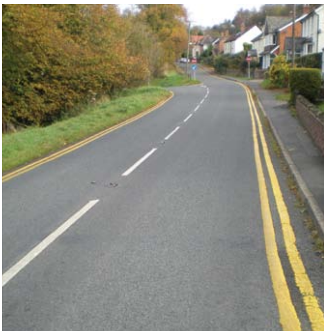
Standard yellow lines can have a greater visual impact

When restrictions on waiting or loading apply, narrow primrose lines should be used instead of the standard width and colour. Such advice is contained in the Traffic Signs Manual, Chapter 5, which states: 'In environmentally sensitive areas, yellow markings to No.310 (primrose) or No.353 (deep cream) may be preferred. Special authorisation is not necessary for any of these shades.'