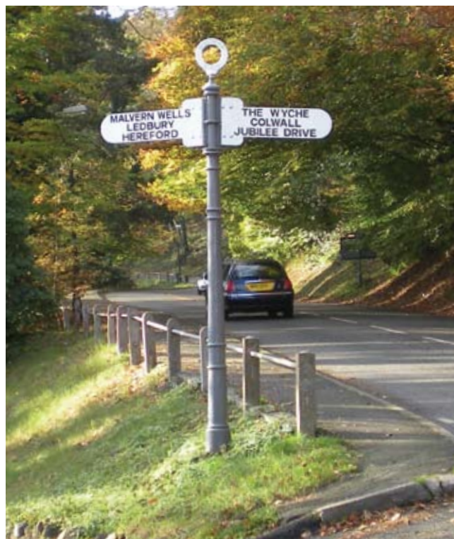
Traditional posts can add character

Traditional finger posts and milestones should be retained and conserved. New finger posts in the traditional local design should be considered as replacements for modern, standard signs in villages and along routes of special character.