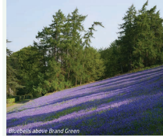
Bluebells above Brand Green

A pottery centre located in the Eastnor Estate in Herefordshire which runs courses and workshops for adults and children: advanced booking is required.