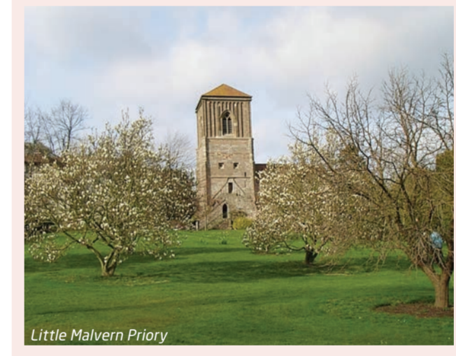
Little Malvern Priory

St Wulstan's church is where the composer, Sir Edward Elgar is buried. The composer lived in Great Malvern towards the end of his life and took inspiration from the hills for some of his pieces.