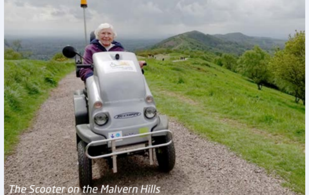
The Scooter on the Malvern Hills

A 9 mile circular walk through the Silurian hills to the West of the Malvern Hills and onto more ancient Pre-Cambrian Malverns. Visiting many rock exposures, their roles are explained in the formation of the landscape. The leaflet has been assembled by the Herefordshire and Worcestershire Earth Heritage Trust.