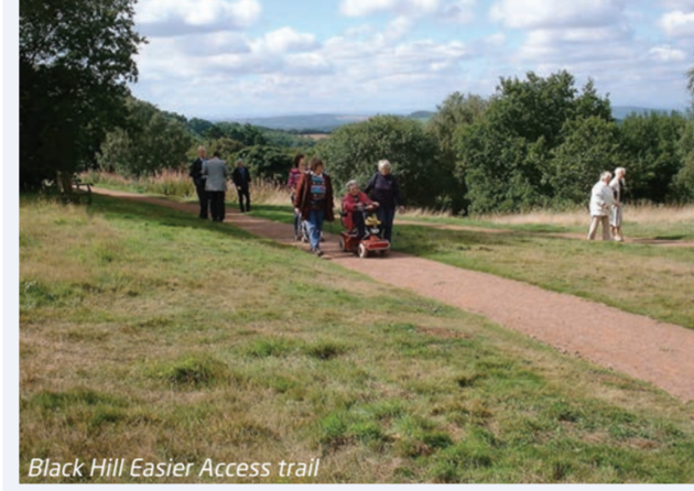
Black Hill Easier Access trail

A 20 mile road ride of moderate difficulty which runs through the Bromesberrow Estate, visiting the settlements of Ledbury and Colwall. The route takes in a number of pubs and cafes as well as sites of historic interest.