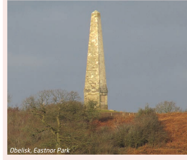
Obelisk, Eastnor Park

A Worcestershire Wildlife site with wildflower meadows and old orchards