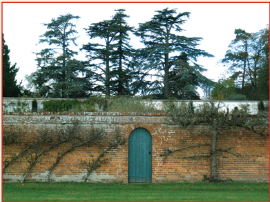
Walled Garden - Bromesberrow Place

© Crown Copyright. All rights reserved. Worcestershire County Council, 100015914. For reference purposes only. No further copies may be made. Gloucestershire County Council 100019134-2008. Herefordshire County Council 100024168-2008