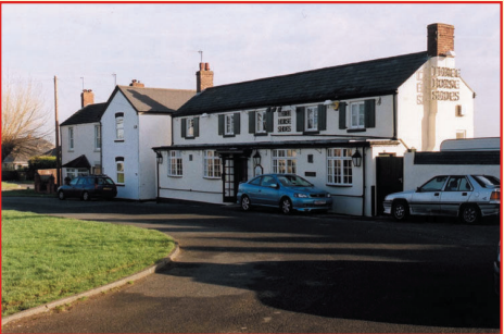
Three Horseshoes PH