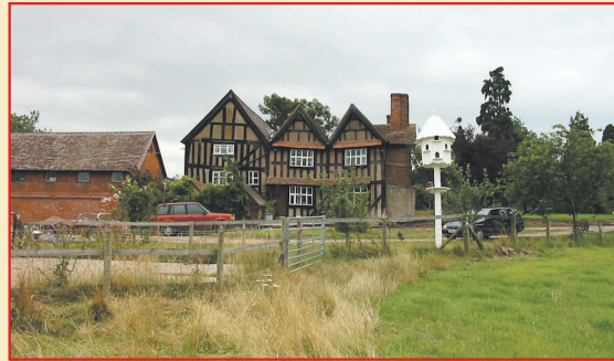
Colwall Park Farm