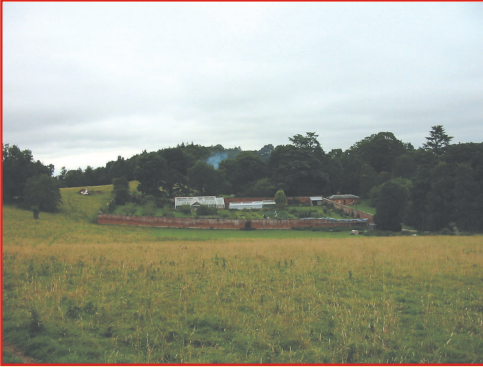
Walled Garden at Hope End

©Crown Copyright Herefordshire Council. Licence LA09069L 2002. The Ordnance Survey mapping included within this publication is provided by the Herefordshire Council under licence from Ordnance Survey in order to fulfil its public function to promote walking in the County. Persons viewing this mapping should contact Ordnance Survey Copyright for advice where they wish to licence Ordnance survey mapping for their own use. Whilst every care has been taken to ensure accuracy of the information in this publication, the Malvern Hills AONB cannot accept responsibility in respect of any error or omission which may have occurred. The producers of this map have no responsibility for the physical state or maintenance of the route and therefore give no warranty as to its condition.