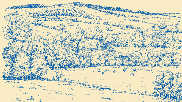
A view of Oldcastle