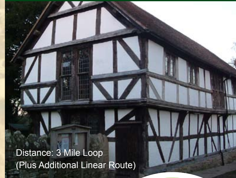
Distance: 3 Mile Loop (Plus Additional Linear Route)